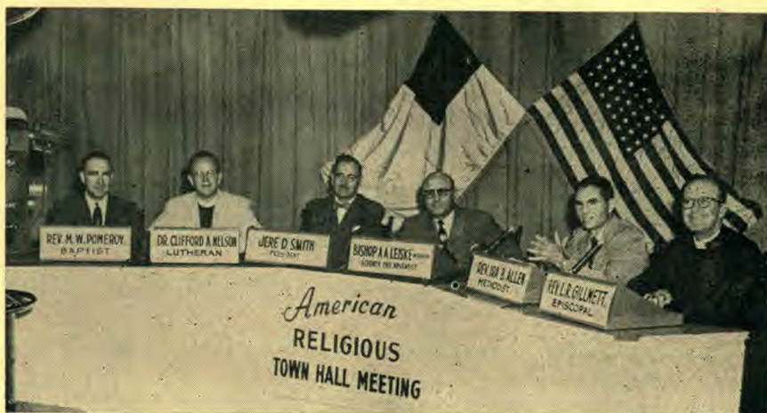
TELEVISION PANEL IN ACTION ON JULY 1