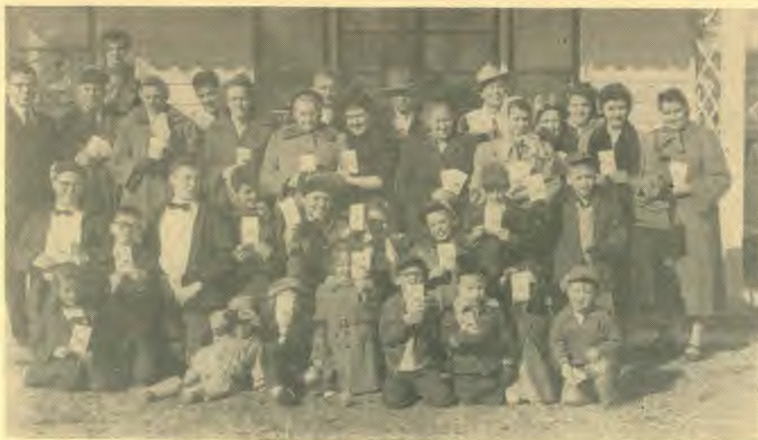
HOME VISITATION DAY AT ROCHESTER