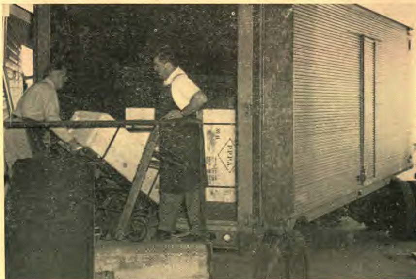
SHIPMENT OF BOOKS FOR INTER-AMERICA

It is better to ask the Lord to direct our paths than to correct our mistakes.