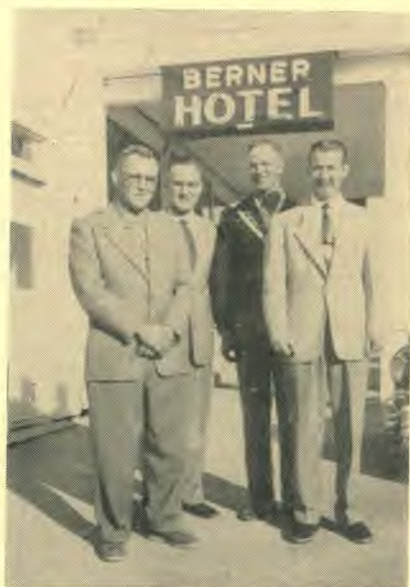
North Dakota Colporteurs who worked at Parshall