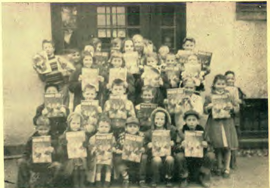
Happy boys and girls of the St. Paul, Minnesota, church school who are successful little missionaries with Life and Health