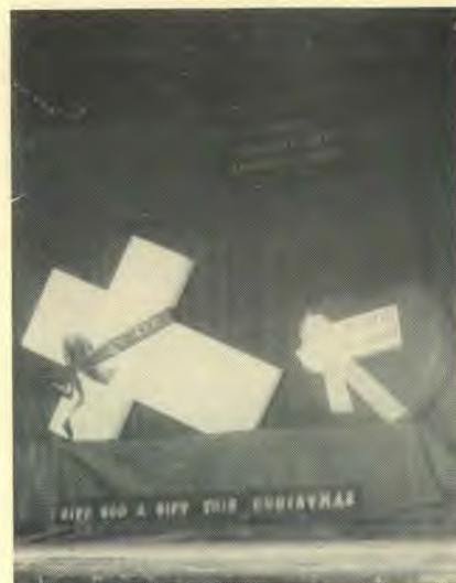
The St. Paul church's display in a store window in response to a Junior Chamber of Commerce invitation to join in a campaign to "Put Christ Back in Christmas."