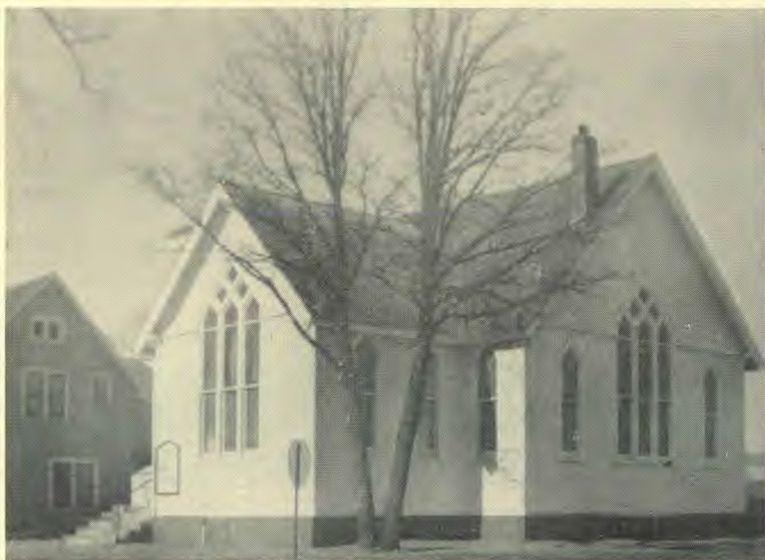
Thief River Falls Church

By our example and personal effort we may be the means of saving many souls from the degradation of intemperance, crime, and death. Temperance , p. 236, 237.