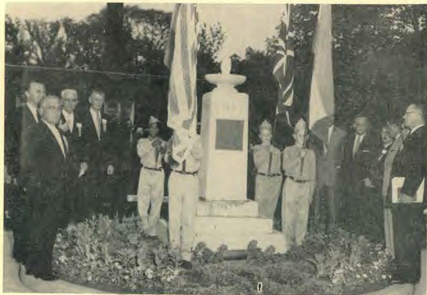
Monument dedicated at Mount Vernon commemorating the fifty-year anniversary of Missionary Volunteers

ADVENT SEAFARERS' MISSION 32, Surrey Mansions, 323, CURRIE ROAD DURBAN, SOUTH AFRICA