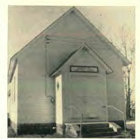
O'd Morgan church now being used as a Welfare Center for the Southwest District

district went "over the top" in the Ingathering in spite of a temporary disablement of the district leader. The members just went to work and raised the Ingathering goal. It was not so very easy to do this as the southwestern part of Minnesota was declared a disaster area because of the floods here last summer and the weather was very contrary at the time of the harvest. The members had to use every opportunity that was favorable to bring in their crop, so it was quite difficult for some of them to find time to go Ingathering. But the Lord blessed the faithful efforts of the members.