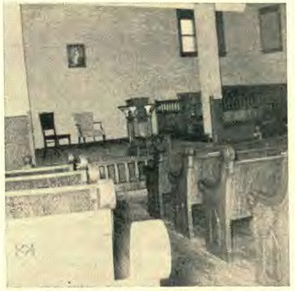
Interior of recently purchased church at Morgan