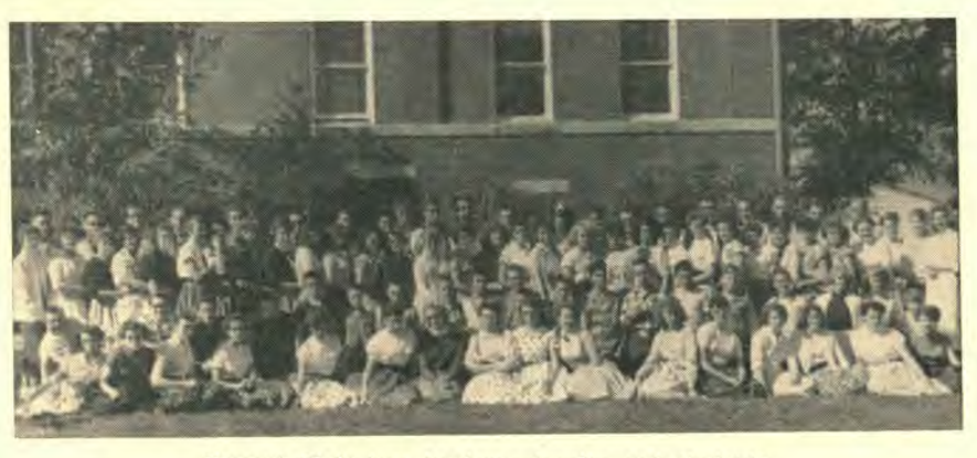
Present Plainview Academy faculty and students.