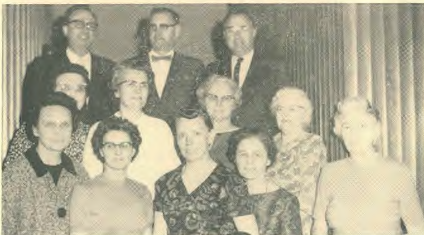
Minnesota Federation officers pose on the steps of the Capri Hotel in St. Paul during a break in the Northern Union Federation Officer's Council held recently.