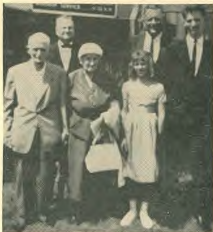
First fruits of the Belle Fourche Tent meeting.

We thank our dear people and all who helped to make these meetings a success for their faithfulness in attendance and for their liberal of-