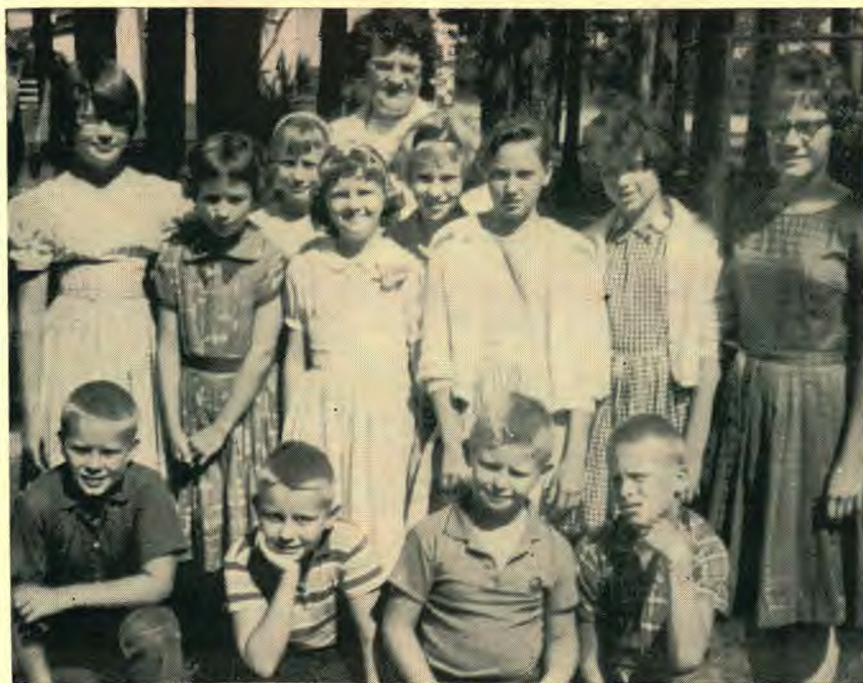
Blackberry Vacation Bible School — Juniors

September 22—Standing Room Only October 6—Alpha and Omega