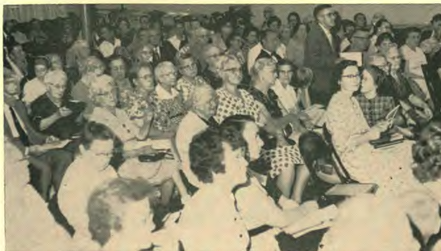
Some of the attentive listeners at the "It is Written" meetings in Winterset.