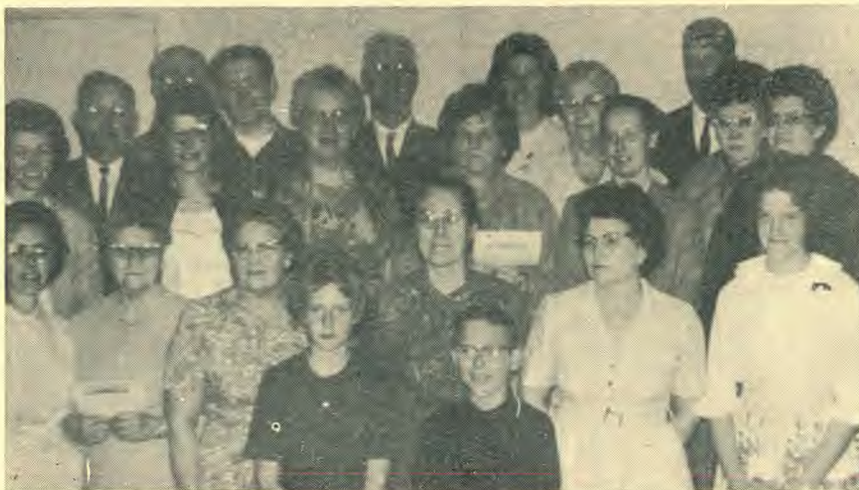
Prophetic Guidance Class—Knoxville

✪ The Home Economics Department at Oak Park Academy has received enough Betty Crocker coupons to get sixteen place settings of Melamine dinner ware for class use. These coupons have been contributed largely by readers of the OUTLOOK to whom the department expresses sincere appreciation. More coupons can be used. Please continue sending them to the Home Economics Department, Oak Park Academy, Nevada, Iowa.