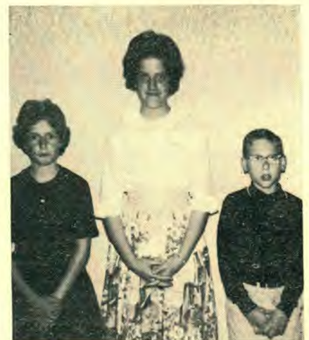
Three young people completed Prophetic Guidance Course in Knoxville