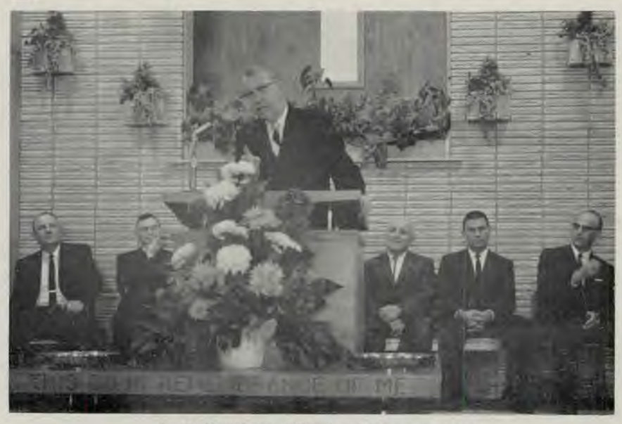
L. II. Netteburg delivering keynote message.