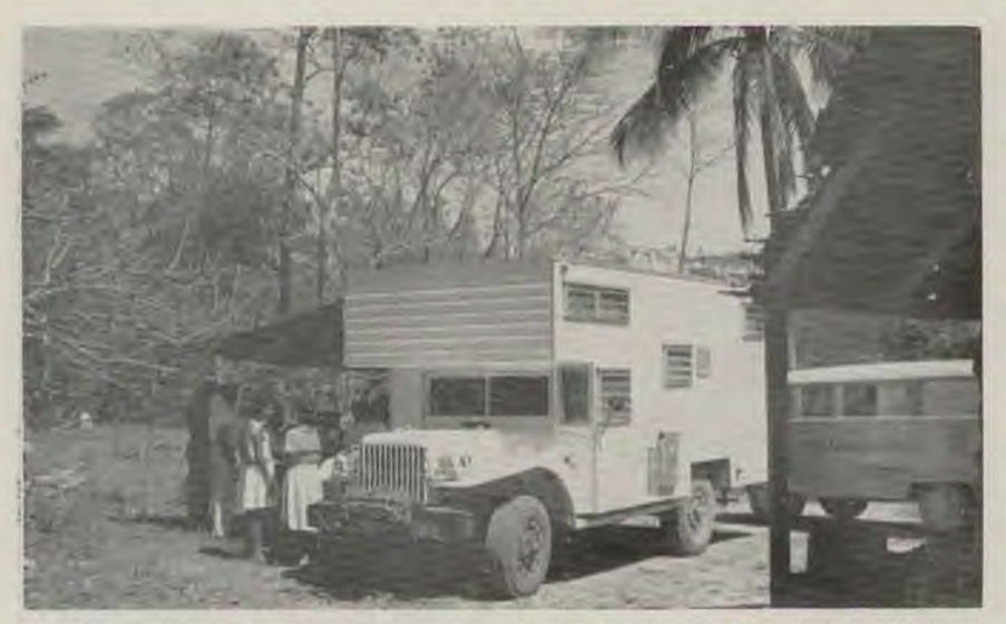
Mobile medical unit sponsored by some of the church members of the Wahpeton church and the doctors of the Wahpeton and Thief River Falls clinics.