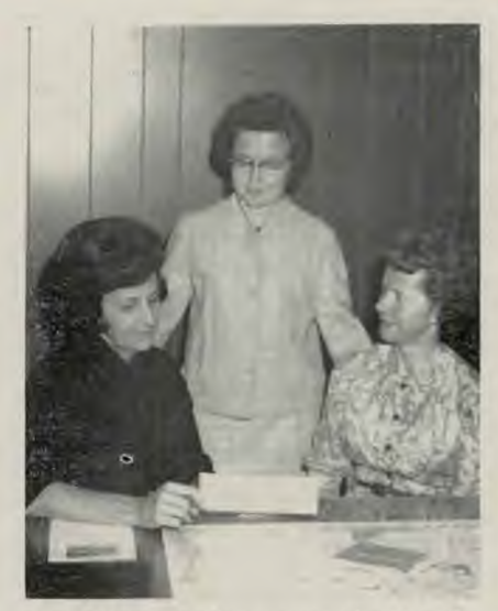
The officers making preparation for the first newsletter.

were offered to the ladies and nearly all present participated in making at least one of the crafts while a number of the ladies completed two. Decorative dolls were made by folding and spray painting Readers' Digest magazines and finishing them with fancy trim, a styrofoam head, and yarn hair. Also a number of lovely pictures were made from crushed rock on a burlap background. Much individual talent was displayed in these crafts, especially in making the dolls.