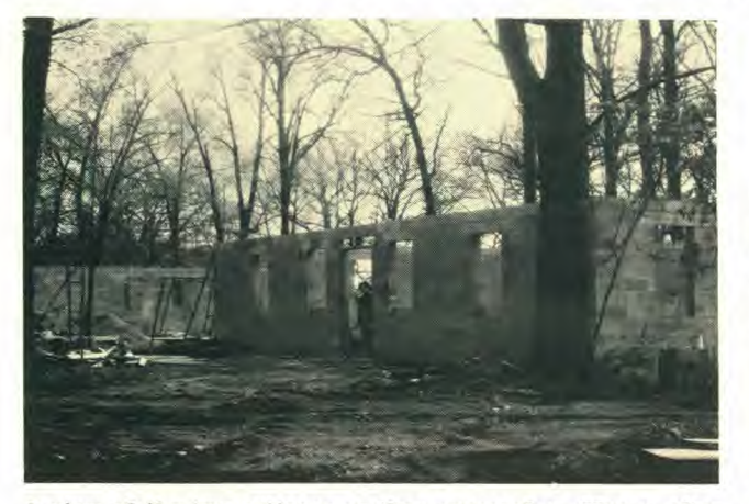
A view of the two cottages as they appeared on May 9, after 5 days of construction.