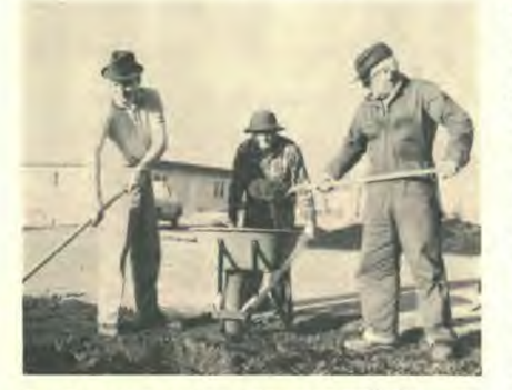
Conference workers "spruce-up" the conference office yard.