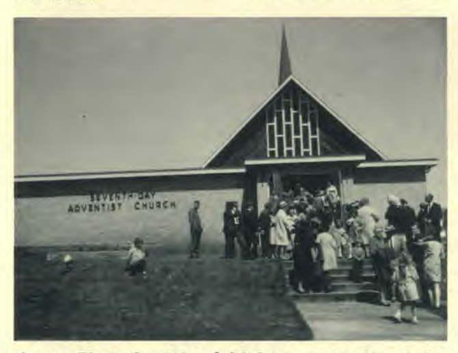
The new Pierre church is a brick-faced concrete block building seating 250. It has 3 adult classrooms, Sabbath School division rooms, prayer meeting room, Dorcas room, and three rest rooms.