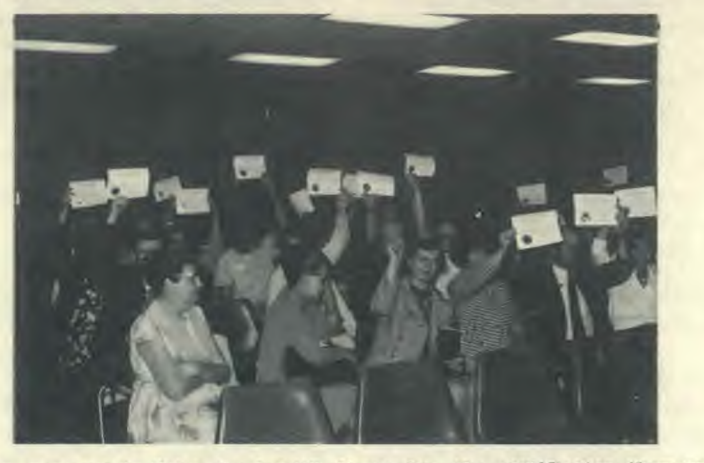
People who managed to "kick the habit" displaying the certificates they received upon graduation.