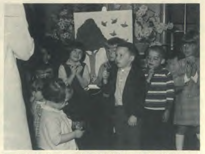
Part of the Cradle Roll-Kindergarten division who sang a song about the bees, each having one attached to his finger. Their device is a bee hive.