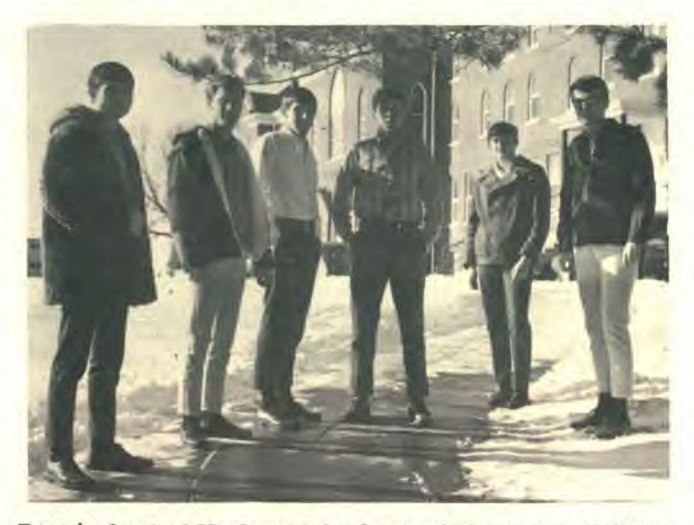
Boys in front of Maplewood Academy Administration Building