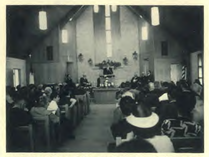
Sanctuary and foyer of the new Pierre church is fully carpeted. This interior view of the church shows N. C. Wilson delivering the dedicatory sermon.