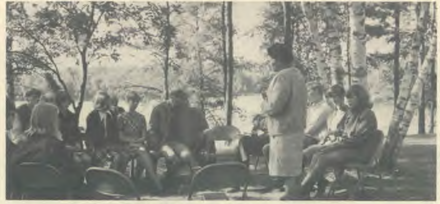
Discussion periods stimulated positive thinking

to meet the thinking and interests of today's young people. Inasmuch as the teenagers of today say, "Tell it as it is," this is just what was included in the planning.