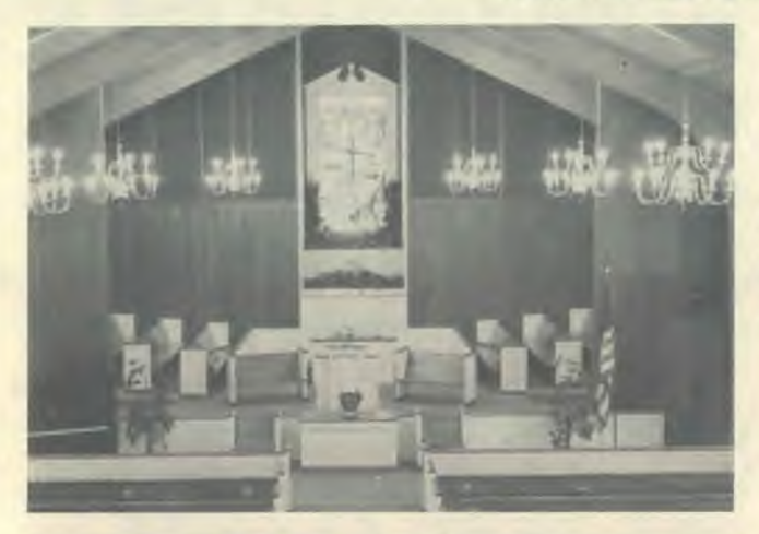
An empty church! What is its value? Who will keep the "lower lights" burning?