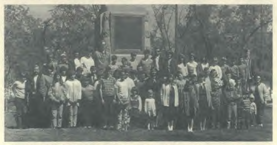
Northwest Iowa Pathfinders enjoy a long-anticipated onting to the "Iowa Great Lakes."