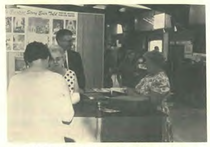
Literature displayed at Kandiyohi County Pair.