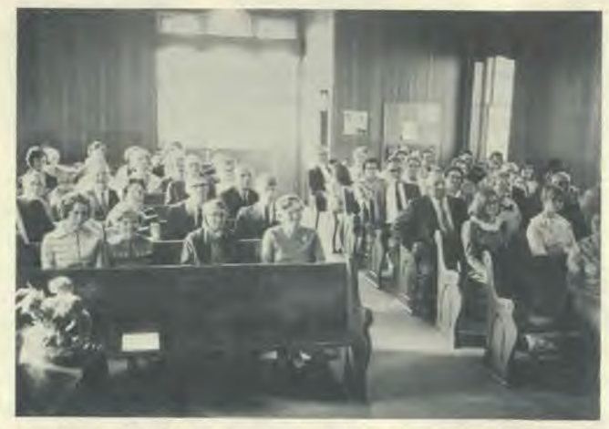
Members and friends present at the Dedicatory Service in Kenmare.