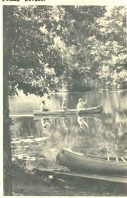
Many enjoyed using the canoes.