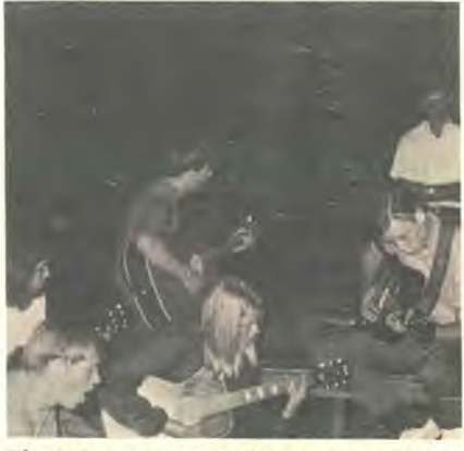
Singing was a favorite pastime for the young people.