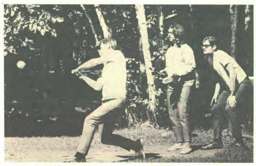
There was plenty of action during the ball game,