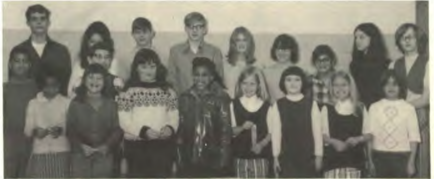
Young people from the church who received Ingathering Awards for their achievements