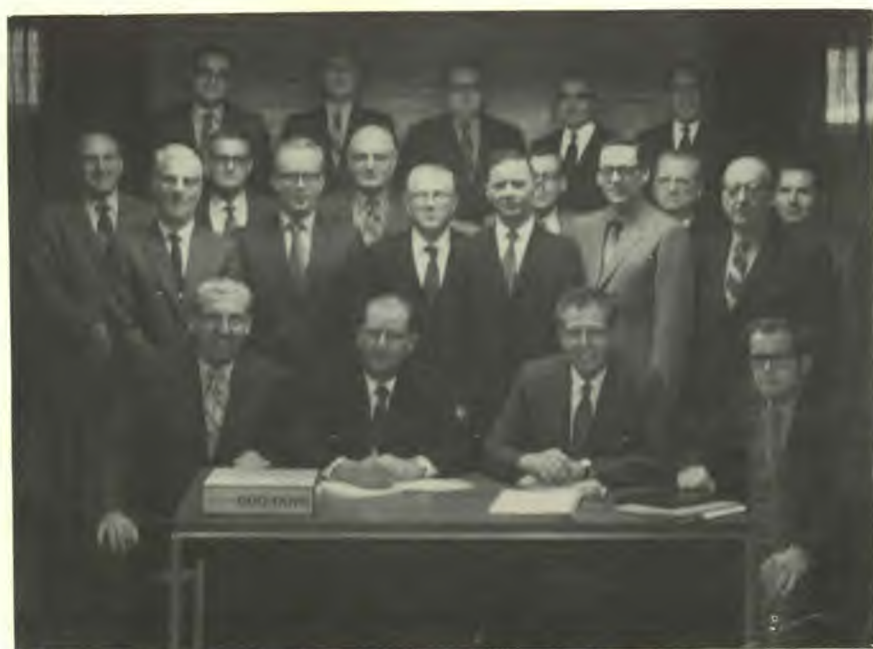
Most of the members of the Northern Union Board of Education which convened in Minneapolis.