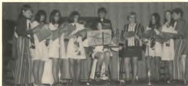
Teen-age group presenting the program "Purpose" at Maplewood Academy.