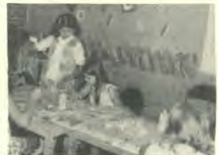
Three primary girls take time out to smile as they complete their workbooks for the day at the Wadena, Minnesota, VBS.