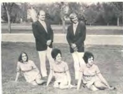
The Master's Singers

The Master's Singers, a new musical group formed in North Dakota, have been presenting the gospel in music throughout the state of North Dakota this summer.