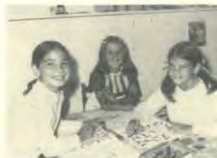
Ames, Iowa, juniors enjoy painting clay dough ornaments.