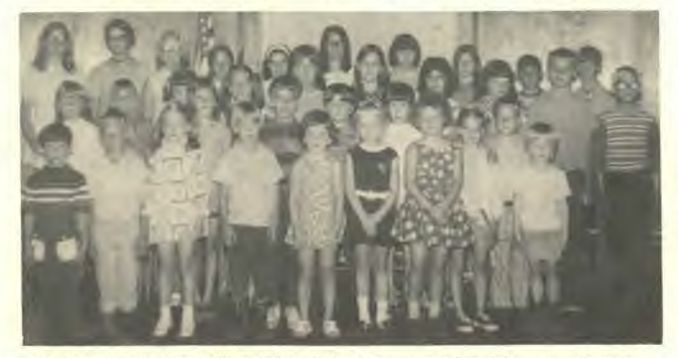
Hurley Vacation Bible School held recently in their new church.

A fellowship hour followed and many parents