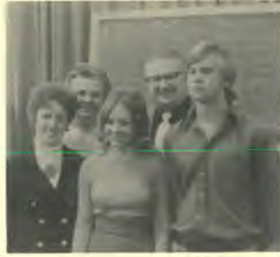
High car for the day came back with over $200.00.

Ninety-eight SRA students raised over $2,200 on their annual Ingathering field day. The students were joined in this missionary outreach by the SRA faculty, sixteen district pastors and the conference office staff.