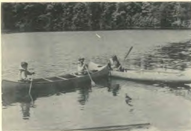
Canoeing, one of the most fascinating water activities.

Dr. Heyerdahl felt that ancient man could have sailed from northern Africa to the new world centuries before Columbus. After building "RA," he and seven men from seven nations set sail from Morocco in May of 1969. Their first boat had to be abandoned before reaching the West Indies, but exactly one year later he and the same crew in RA II safely reached Barbados after a trip of 57 days.