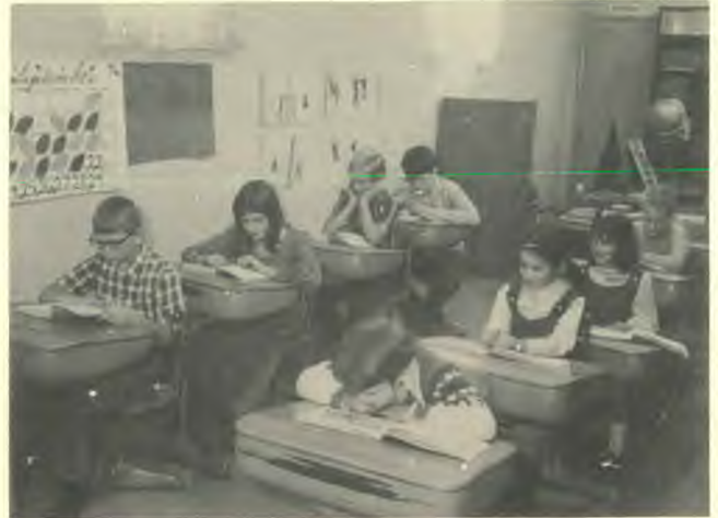
Some of the children from the Cambridge church school.