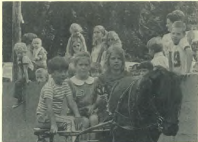
The children received pony rides during recreation time.