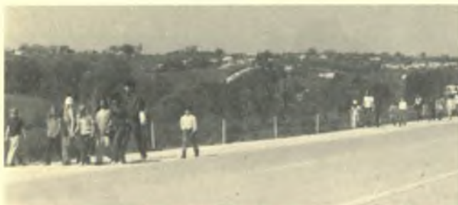
The Des Moines church school students as they enjoy their Walkathon to earn money for a new school bus.

Forty Des Moines elementary church school students completed a 20-mile Walkathon to raise money for a new school bus on the first Sunday in May. Approximately $900.00 was raised by those who participated. Forty-four students and four adults started at the school in Des Moines and finished in Indianola at