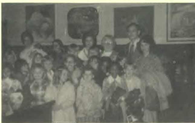
Des Moines teachers and students with Governor Ray, a visit that was enjoyed by all.

Other activities of the school year included field trips. The lower grades remember very vividly their trip to the State Capitol and a visit with Iowa's Governor Robert Ray. Governor Ray spoke to the students concerning the function of the governor to the state of Iowa. After his short presentation he posed for pictures with the students and signed autographs.