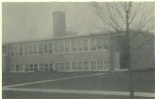
The building that will house the Grand Forks church school for the school year 1974-75.

The Grand Forks church is in the process of making final preparations for a church school to begin operation this fall. The greatest hurdle to overcome was that of finding adequate building facilities without the overburden of immediate construction. After much searching and prayer, very excellent facilities were rented from the St. Marks Lutheran Church. These facilities will house the Grand Forks church school for the 1974-75 school year.