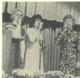
A trio from the Hinckley church.