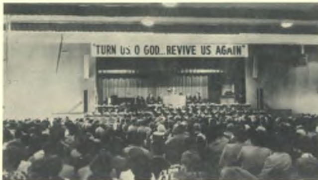
The packed auditorium on Sabbath morning.