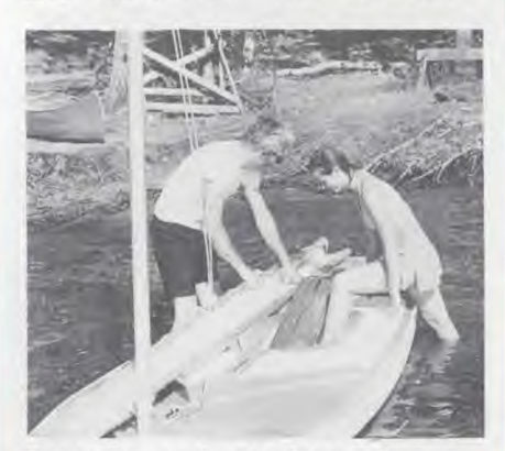
Teacher and student play as well as learn together.

It was a total learning experience for both students and teachers. The students