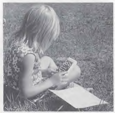
A little bird told me the answer.

The first camp of the 1976 season at Northern Lights Camp was a unique experiment in education. Named the Outdoor School, the camp brought together students and teachers