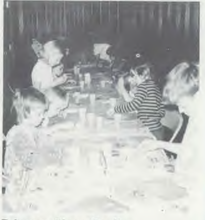
Primary Class Crafts.

which means they likened the real tools a carpenter uses to the means children use in their individual lives to build a good character.