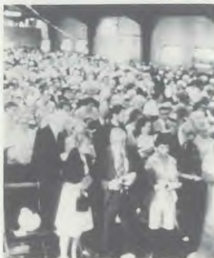
LAST YEAR-Camp meeting 1976 was the largest in North Dakota's history, but 1977 should be even bigger.