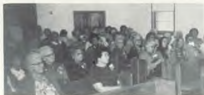
"Strangers in the Pews"