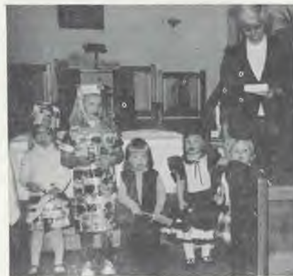
Cradle Roll-Kindergarten Division at program time.