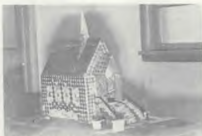
Junior Division Church