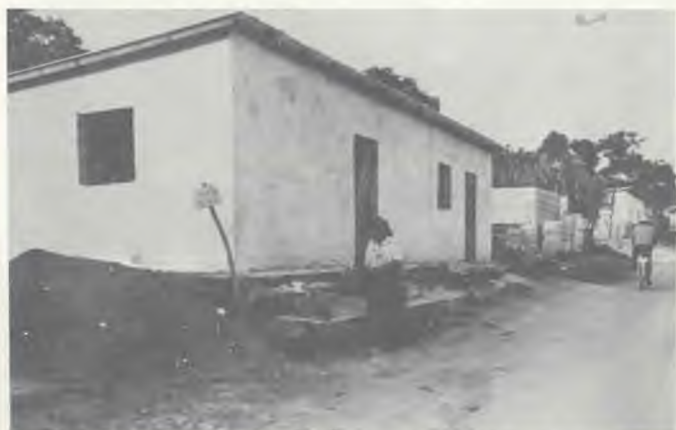
SAWS recreated these neat cement block quake-resistant homes in San Lucia de Milpas Altas: over 1000 now finished throughout Guatemala.

The child-feeding program in Chile is today reaching very close to the projected plan of feeding 150,000 malnourished