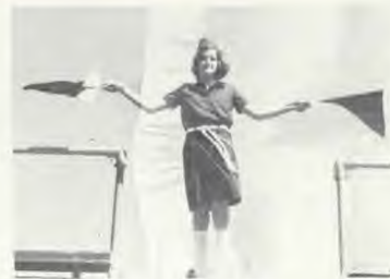
Minnesota's Pathfinder Fair