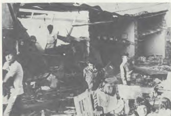
Guatemala homes in shambles after earthquake.

I do not know whether 1976 will be known as the year of the earthquakes or not. The total number has not been reported as yet, but it was reported that 1975 chalked up a total of 4,000. We also know that in 1976 more than 1,600 earthquakes were recorded in Guatemala alone.