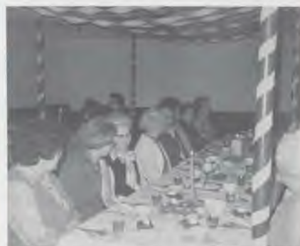
Ladies of the Leola community hosted by the Ladies Circle of the Leola SDA Church.