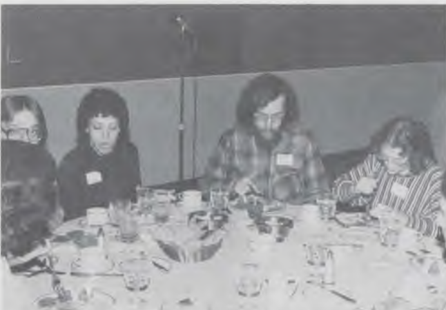
Guests enjoying vegetarian dinner.