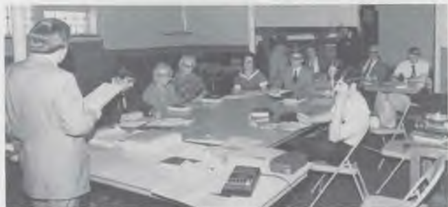
Waterloo Communication Workshop.

"We sometimes get too concerned that others understand us Seventh-day Adventists, what we believe, etc., and appear disinterested in understanding others, what they think and