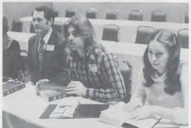
Revelation Seminar students in rapt attention.