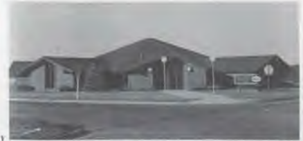
The Jamestown Church—at the heart of the project.

At the heart of every project—a sale, a supper, a fair, a program—is its purpose—providing a need.