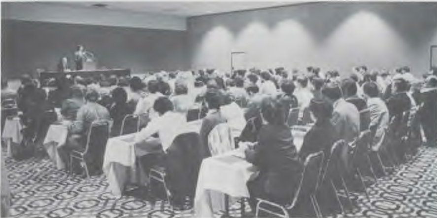
Cedar Rapids It Is Written Seminar.