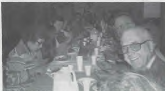
Bedford, IA, Church Ingathering Victory Dinner.