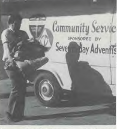
Community Services organization at flood at Grand Forks, North