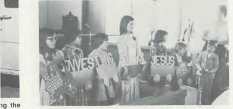
Sabbath School Investment at Mandan, North Dakota.