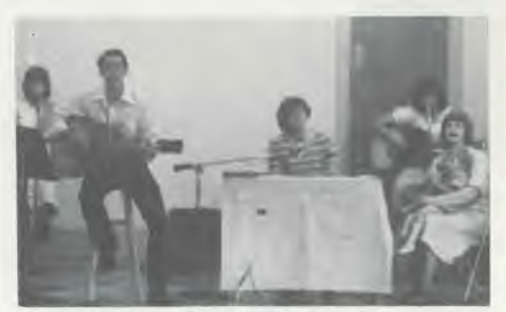
The Zillmer Family.