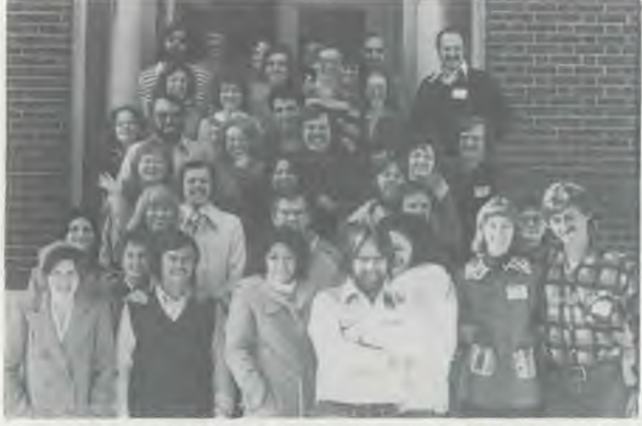
Graduates of the Compleat Parent workshop, part of the Burlington, Iowa, Better Living program.