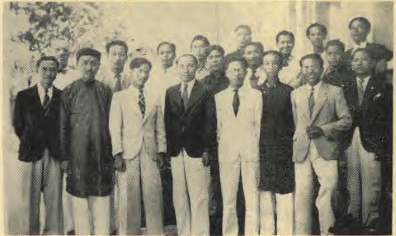
Colporteurs' Institute—Saigon—January 26—February 3, 1940. Regulars in front row.

But the colporteur is not only a traveller; he is perhaps the only one who can find souls in places where the minister cannot go. Oh, it is a joy to be a colporteur evangelist!