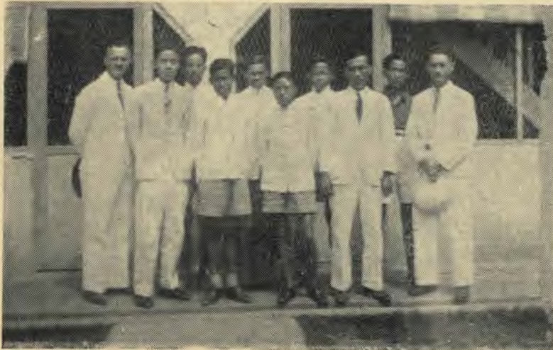
School Institute—Bangkok—Last week of February, 1940.

During my last year of canvassing, I have travelled nearly ten thousand miles, had audience with over ten thousand people, men and women of all ranks; interested over one hundred souls whom, I believe, will soon join the Kingdom of God. The energetic colporteur has the chance to travel, enjoy beautiful scenery, talk with professors, royal folks and sultans. I am not afraid to face these people. I have gained audience with many of them and have been entertained by them in their residences and palaces. "I can do all things through Christ which strengtheneth me." Phil. 4:13.