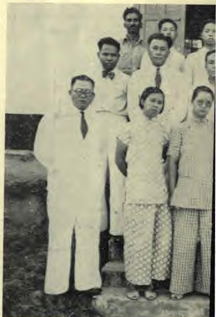
Malay States Colporteur