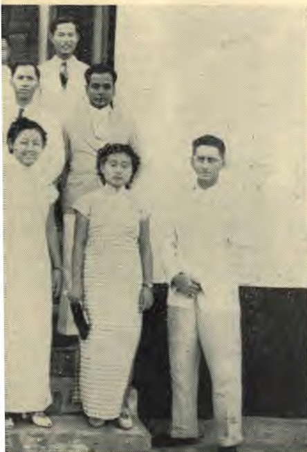
Institute—March 16-23, 1940.