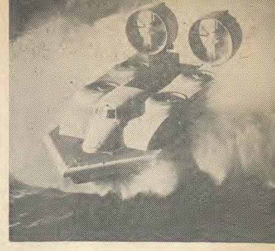
The Hydroskimmer rides one-half metre above water surface. It can attain speeds up to 130 kilometres per hour.

Up until fairly recently there were many grounds on which some doubted the accuracy of the Bible record. But along came the great archæological era which swept away these doubts by the remark-