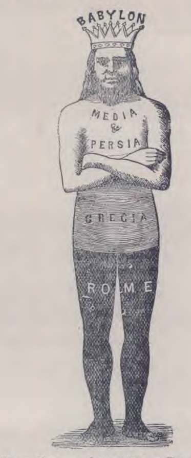
THE GREAT IMAGE OF DAN. ii.

Verse 48 indicates that efforts would be put forth to unite these nations. They should mingle with the seed of men. Royal houses would intermarry, but it would be of no avail. There could be no union. Charlemagne, Charles V., and Napoleon I., all tried to unite Europe into one grand empire and failed. One writer has truly said that one line of God's prophecy is stronger than all the power and plotting of men. The last state of world empire is a divided state, each divi-