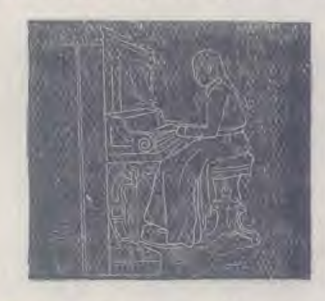
FIG. 2 INCORRECT POSITION.

A depressed chest is a weakened and inactive one. A prolapsed stomach resulting from a relaxed position in sitting or from waist constriction by the corset or