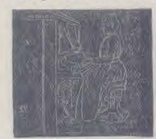
FIG. 1 CORRECT POSITION.

A flat, hollow chest means compressed lungs, which are never for a moment free to expand to their fullest extent, and hence are more liable to consumption and other diseases than lungs which are well developed and have full play in their movements. Round shoulders resulting from posterior curvature of the upper part of the spine are always connected with a flat or