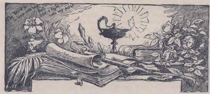
____In the School of Christ.___