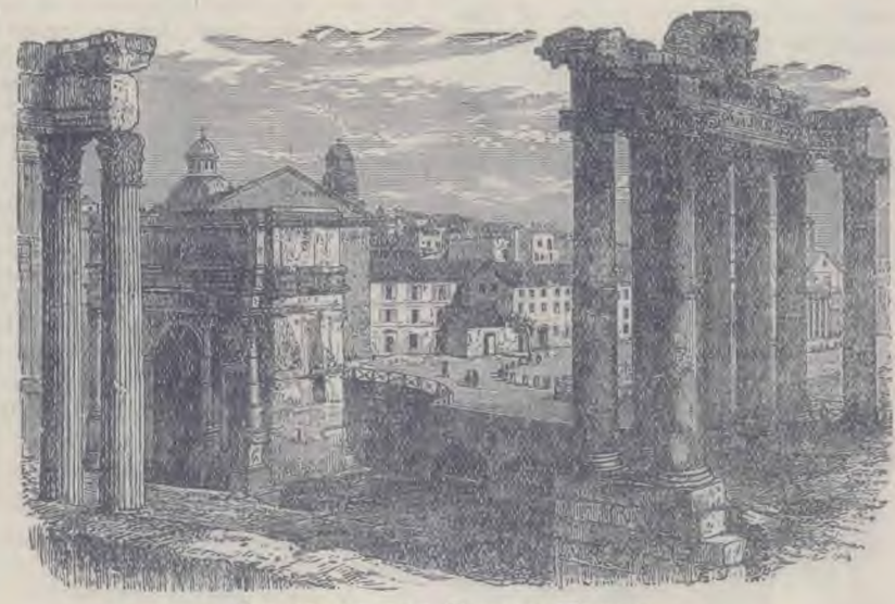
RUINS OF THE ROMAN FORUM.

But not all of these tribes were favourable to the pretensions of the bishops of Rome. Some of them, especially the Heruli,