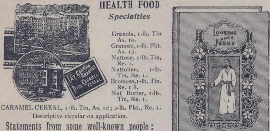
LOOKING UNTO JESUS Or CHRIST IN TYPE AND ANTITYPE

Four Hundred Practical, Wholesome, Economical, and Delicious Recipes; much useful Culmary Instruction; 35 Illustrations; 128 Leathrette covers, As. 12, post-free.