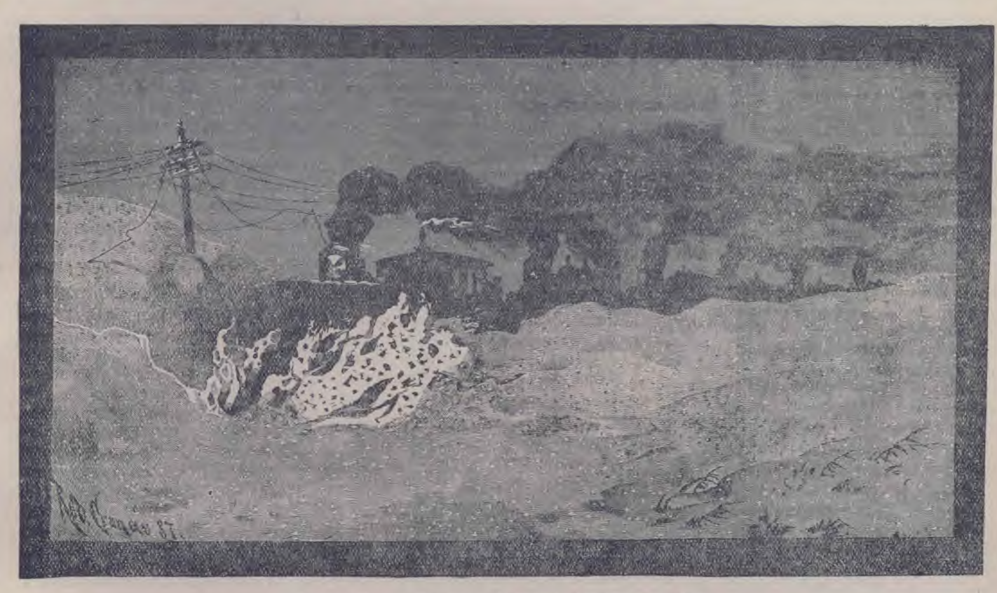
Locomotives with Snow-Ploughs clearing the Line.

"In late February, in early March, or whenever the snow 'crusts' and enables