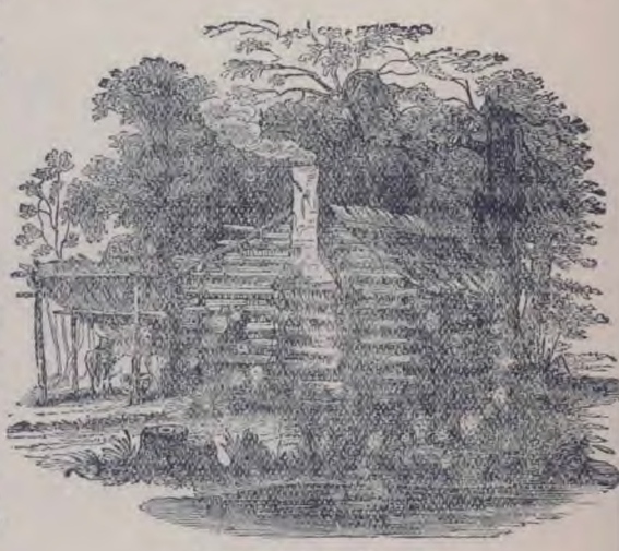
The Old Log House.

There was a Being at the door of that schoolhouse-I say, a Being-and what he thought of that boy was the embodiment. the incarnation, of the old idea of children, He did not say these words, but this is what he thought: "Come in, come in, you little villain, you miserable boy! Your animal spirits show that you are wicked. Come in: I will train you; I know how to