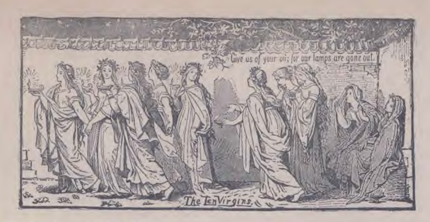
Fill My Vessel With Oil.

Fill my vessel with oil, Lord, With the oil of Thy love and grace, Lest in the time of trial, Lord, There's no strength to seek Thy face; Now while there's time to buy, Lord, While mercy still is nigh, Lord, Fill my vessel with oil.