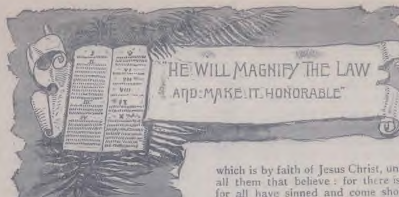
The Law in Christ. THE RELATION BETWEEN THE LAW AND