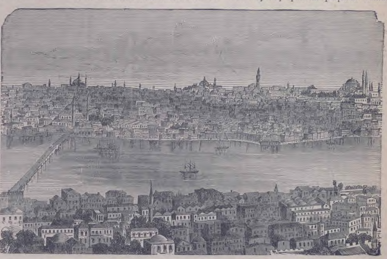
VIEW IN CONSTANTINOPLE, THE CENTRE OF THE "NEAR EAST."

WE can here touch in the briefest possible way only upon one prophetic outline