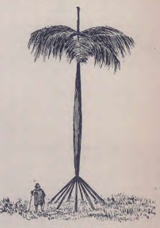
Brazilian Stilt Palm,

IN the mangrove forests of Brazil, amid pisang (plantain) trees, spice-lilies, tree-ferns, mangrove trees, and twining lianas, promiscuously interwoven, may be found a rare specimen of the vegetable kingdom, not unaptly named "stilt-palm." After the