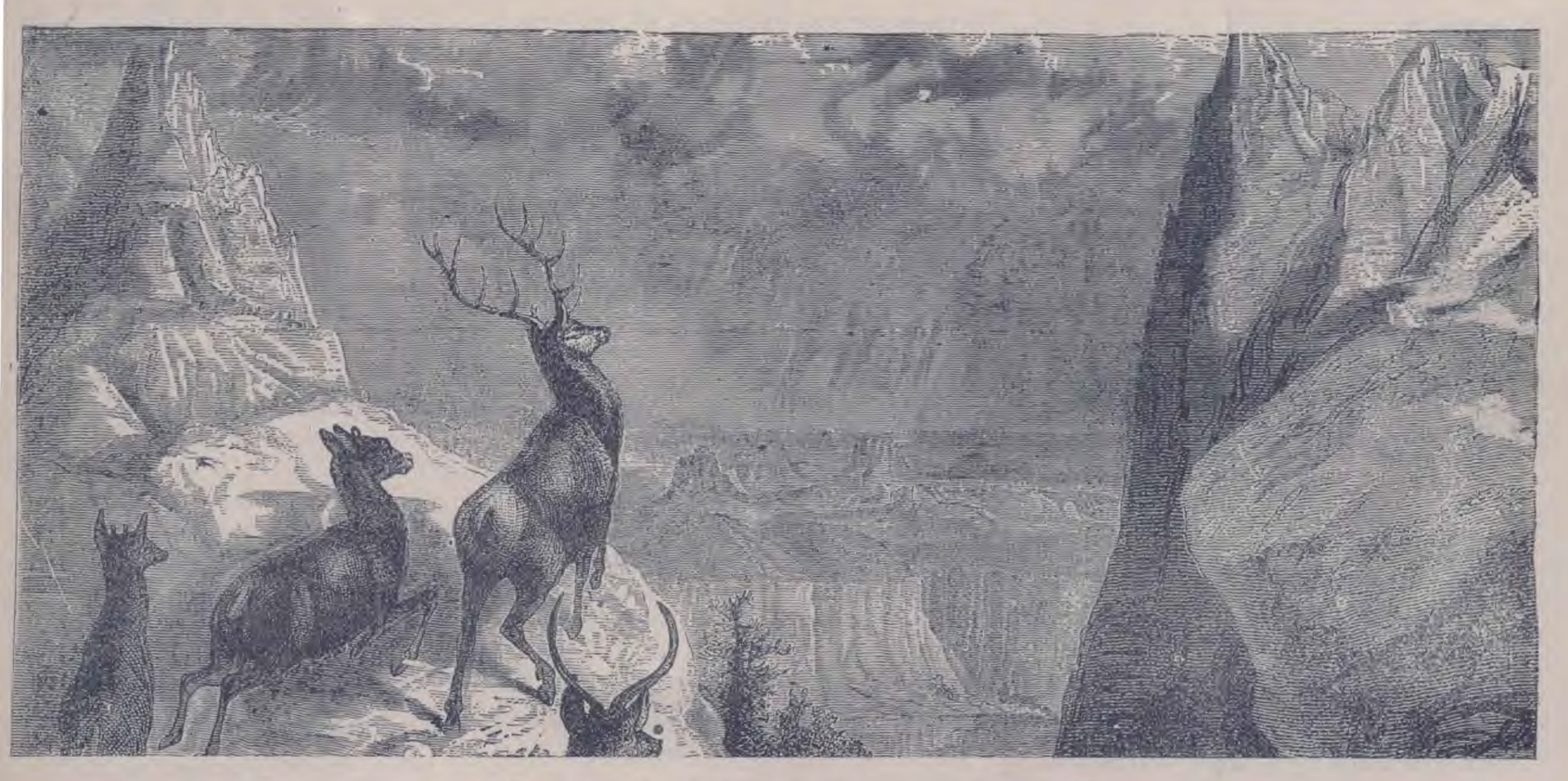
"THE NIGHT IS FAR SPENT AND THE DAY IS AT HAND."