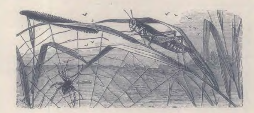
THE SPIDER'S WEB.

The spider's web is taken to represent the covering of self-righteousness worn by the hypocrite. "They conceive mischief, and bring forth iniquity, ... and weave the spider's web. ... Their webs shall not become garments, neither shall they cover themselves with their works: