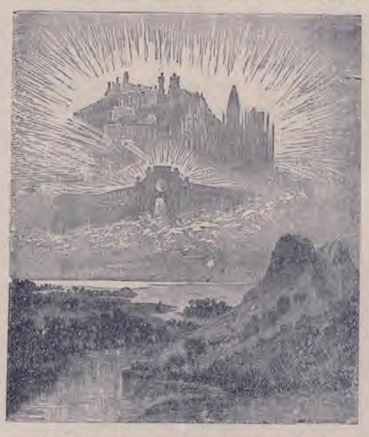
Not from above, but from beneath.

It is equally evident from experiments that the individual under the hypnotic spell of another, remains in this one's power until he voluntarily surrenders control. There is that much of truth in the "uniformity" plea. What is not true is the claim that this latter class of persons do not manifest the same powers and subjective states as the self-entranced mediums