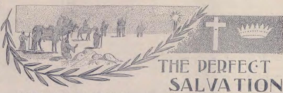
THE THREEFOLD MESSAGE OF REV. 14: 6-12.