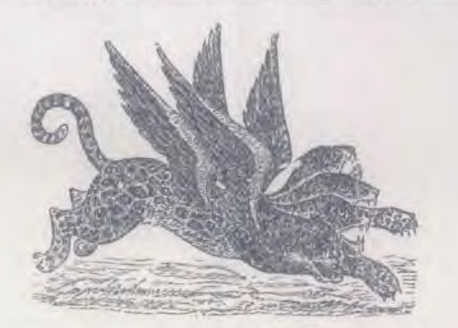
Alexander ; and four heads, signifying the division of the kingdom into four

The leopard had four wings, denoting the rapidity of Grecian conquests under