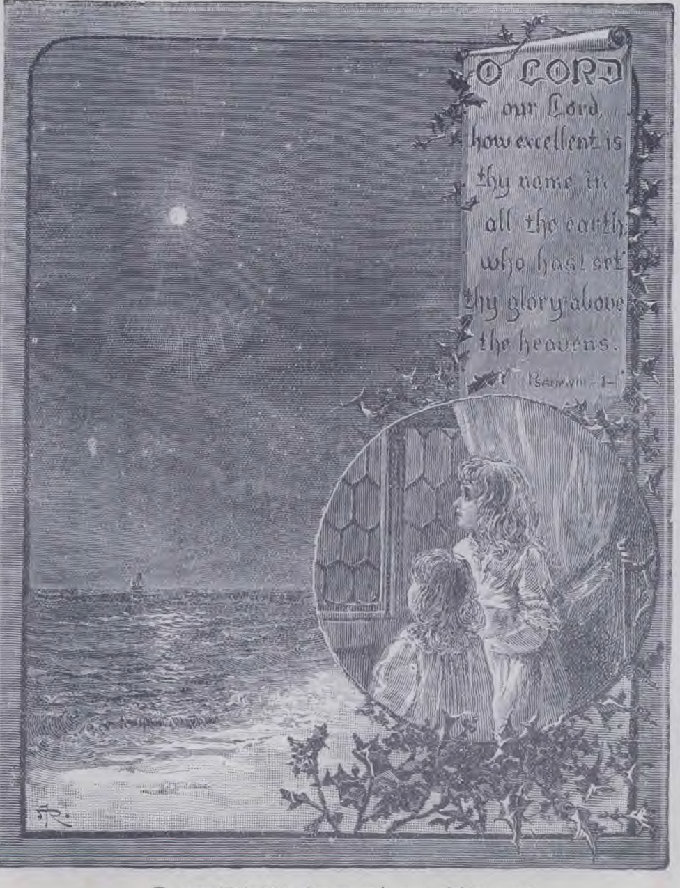
To grasp his heights of power no human might can soar, His wisdom's realm no human intellect explore.

prejudice, neglected the poor and needy, and some among them frowned upon their existence.