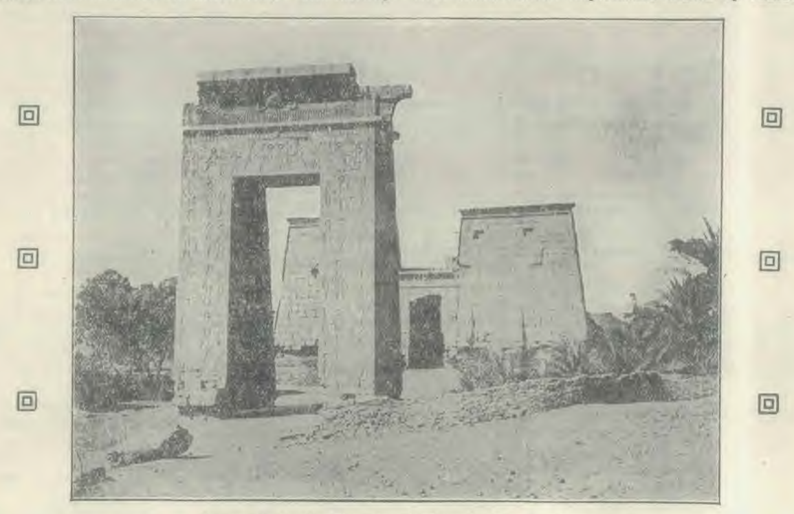
Approach to the Temple of Karnak, Luxor, Egypt The Greatest of Man's Architectural Works

Here and there modern methods are taking the place of antiquated ways of doing things. Once we actually saw a Ford tractor at work. We would not suggest that that was the only Ford tractor in Egypt, but it is certainly true that the majority of the people are still ploughing with their crude wooden implements drawn by camels,