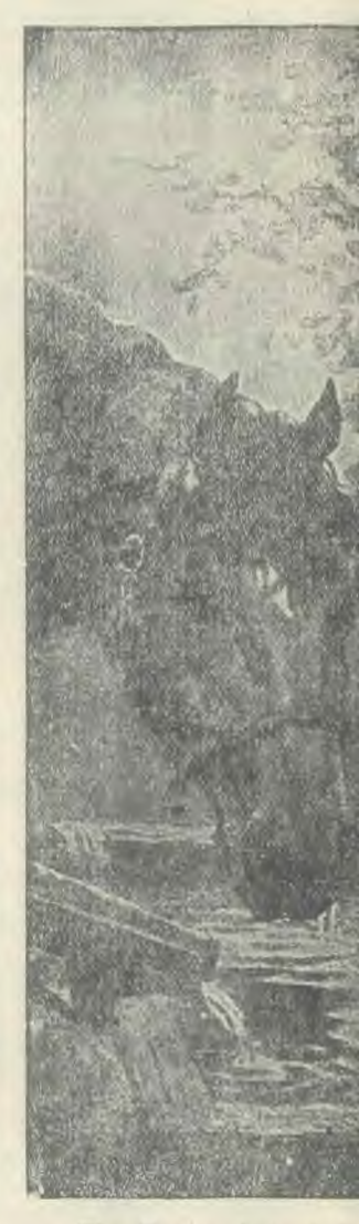
The Entire Animal W Man only Tu

around which are gathered thousands of weeping and disconsolate friends and loved ones, through whose tears there streams not a single ray of hope, for God has said that no drunkard shall inherit eternal life. Ruined and cursed in this life, dishonoured in death, and with no hope of life in the world to come! And to fill depleted ranks of these debauched and deprayed victims of rum other thousands of beautiful boys and girls must be supplied annually from our homes. Think of this, fathers and mothers! What an awful tragedy! Those who believe and advocate that this infernal traffic should continue ought to be willing to come forward with their boys and girls to fill the depleted ranks of the staggering, besotted, ruined victims. Through millenniums of time the touching cry of suffering womanhood and the famished wail of beggared childhood have been ascending to God for deliverance from this terrible evil which covers the earth like a funeral pall. Why the distillery, brewery, and bar are allowed to continue their work of corruption and ruin we cannot understand, when we could banish them from among us if we would.