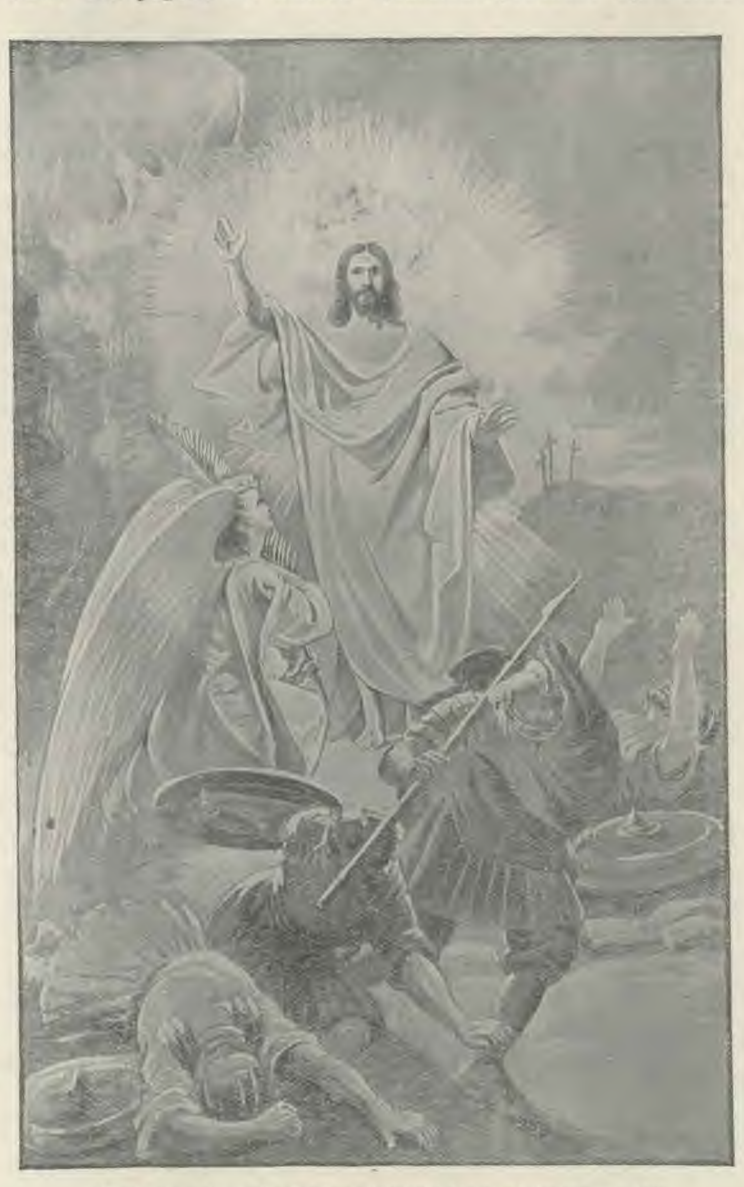
"He is risen from the dead; and behold He goeth before you into Galilee; there shall ye see Him: lo, I have told you."

Now if they lied, and these things were not true, and Jesus did not rise from the dead, then we are compelled to accept a miracle just about as great as His resurrection would be. These few despised Jews, without power or prestige, went into all the provinces of the Roman Empire, to men of other races and heathen religions and other languages, and persuaded them to believe this lie. Not by scores, or hundreds, or thousands, but literally by millions, and of all ranks, of both sexes, young and old, natives of the provinces and Roman citizens, even some in the