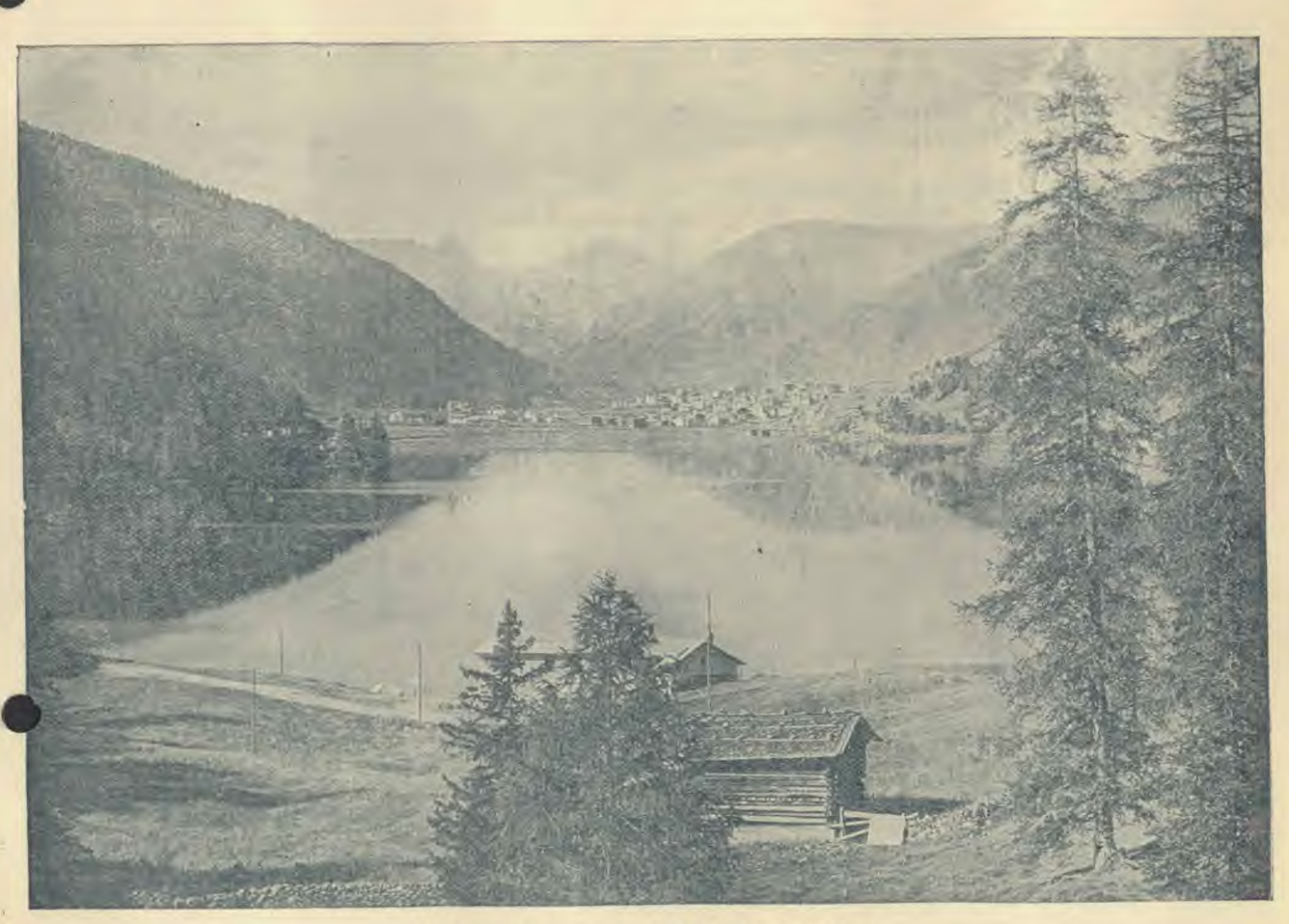
In Green Pastures And Beside Still Waters.

The Eucharistic Congress—What to Do for Snake Bite—Two Eloquent Events—Weakening of Our National Defence.