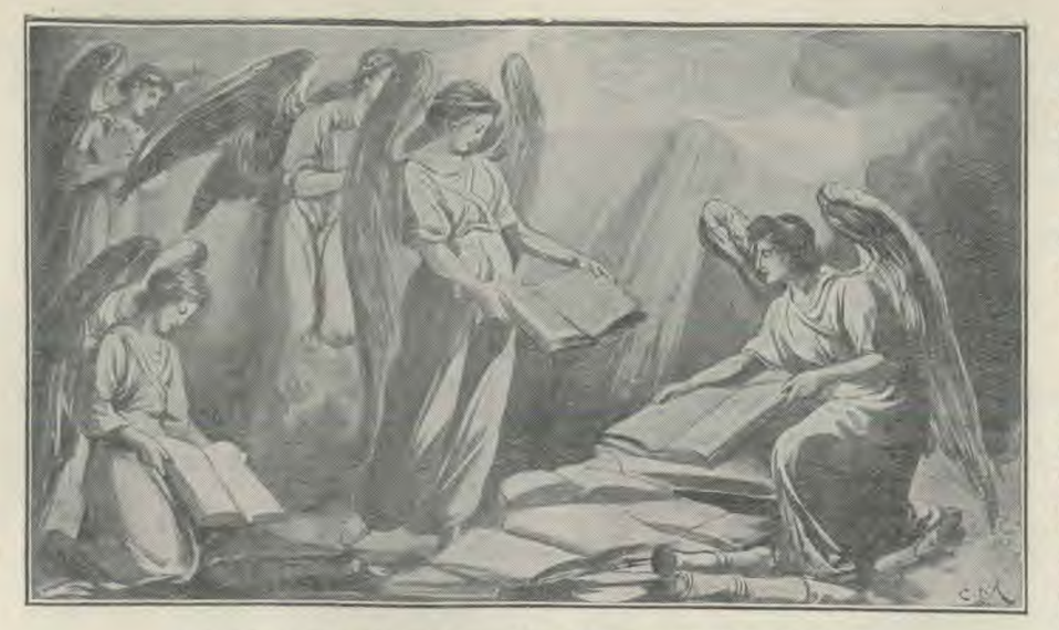
"And They Were Judged Every Man According To Their Works."

Recorded on the pages of this book of life is every act which has ever been committed by the child of God. Written down there is every secret thing which we have ever done. These things are now passing in review before God.