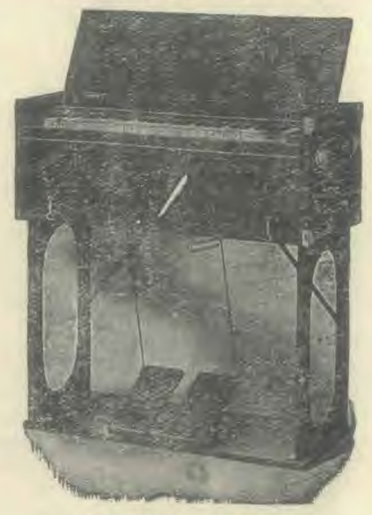
Large Variety of Models Built especially for the Tropics Prices range from Rs, 185,—Rs. 395.

By the celebrated Makers STEPHEN'S, of London