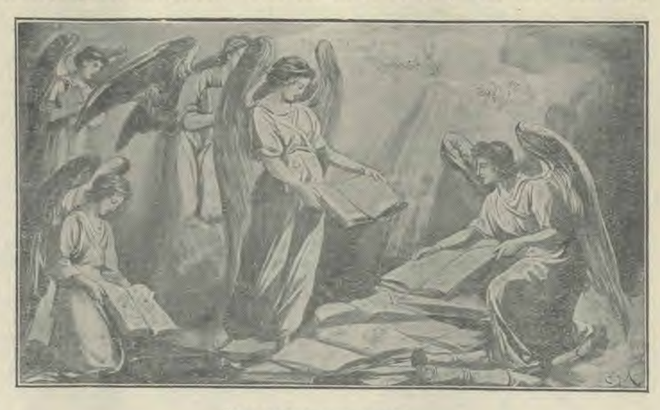
"And the books were opened"

How real the picture is made by the books of record: We are told in the Scriptures that there is a book of life (Rev. 20:12; Ex. 32:32), a book of remembrance (Mal. 3:16), and a book of iniquity (Isa. 65:5-7), out of which the saints will be judged. The judgment will first begin with the house of God, with those who were