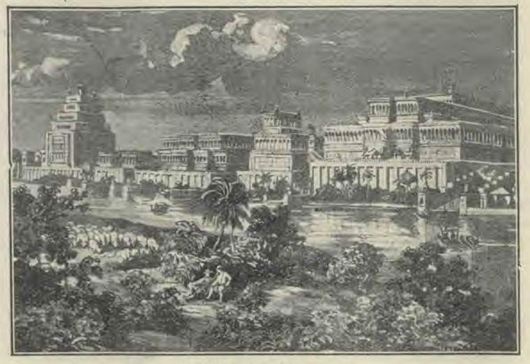
Babylon in all its glory

time, and that the acceptance of God's call in the midst of the city life of that time meant much, and even more, than it means to the business man of our own day who hears the voice of Spirit calling him to follow Christ. Abraham had the same temptations and the same inducements to turn a deaf ear to the