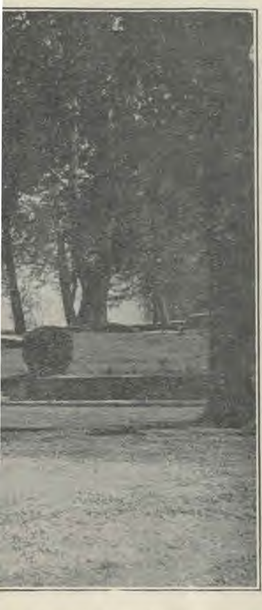
Shalimar Gardens in Srinagar, Koshmir, A quiet peaceful retreat

e settlement of the disarmament problem unless security is st guaranteed. They begin by saying that security comes fore the limitation of armaments, and that when they are sured of this security, they will accept limitation.