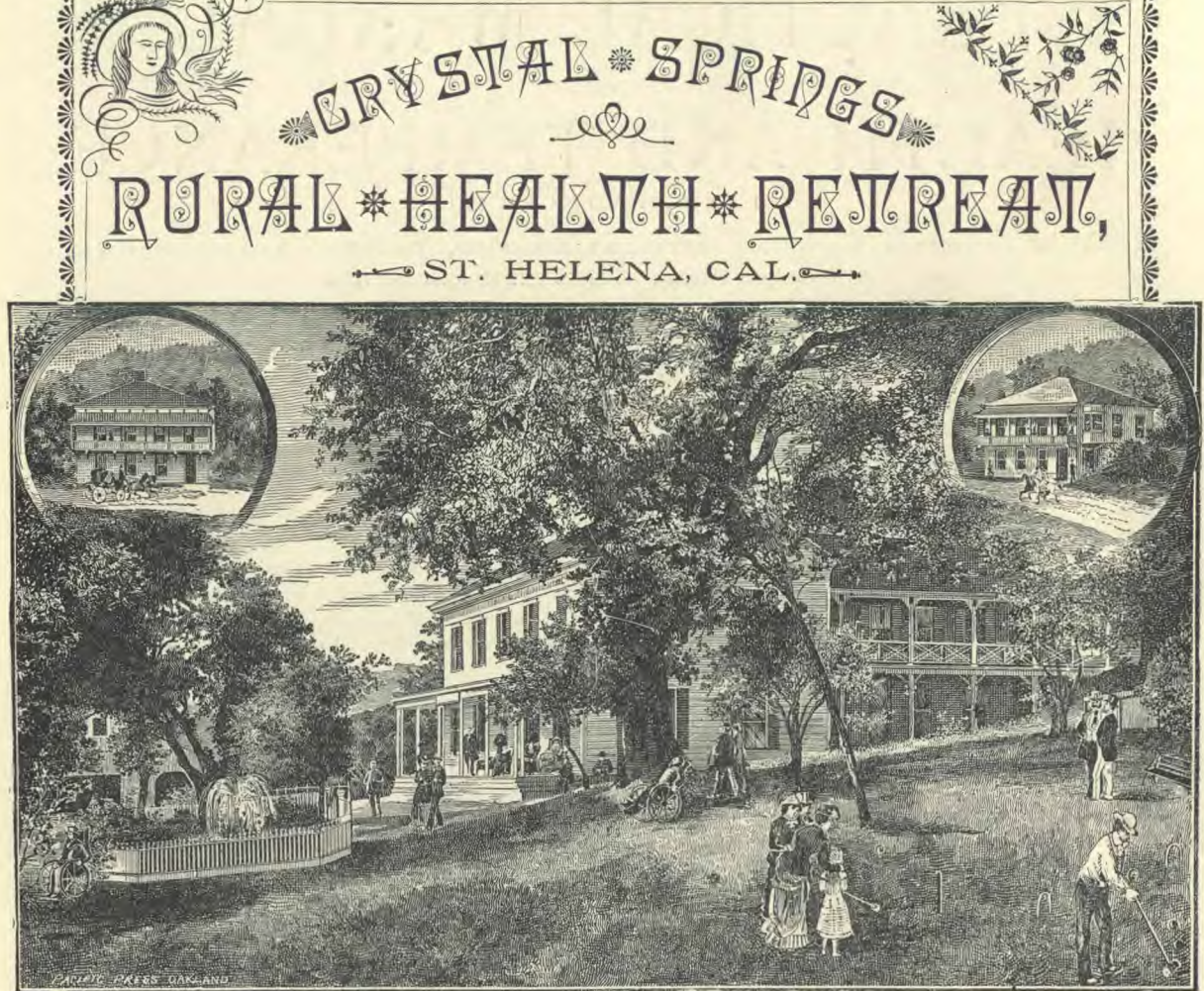
RURAL HEALTH RETREAT, CRYSTAL SPRINGS, ST. HELENA, NAPA CO., CAL