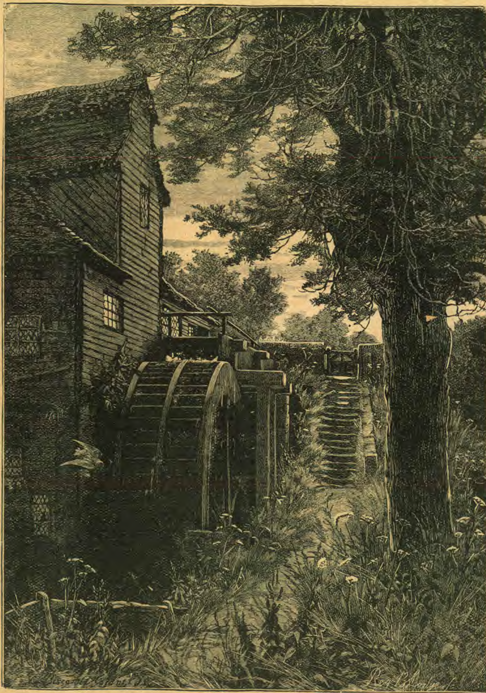
THE OLD WATER MILL.