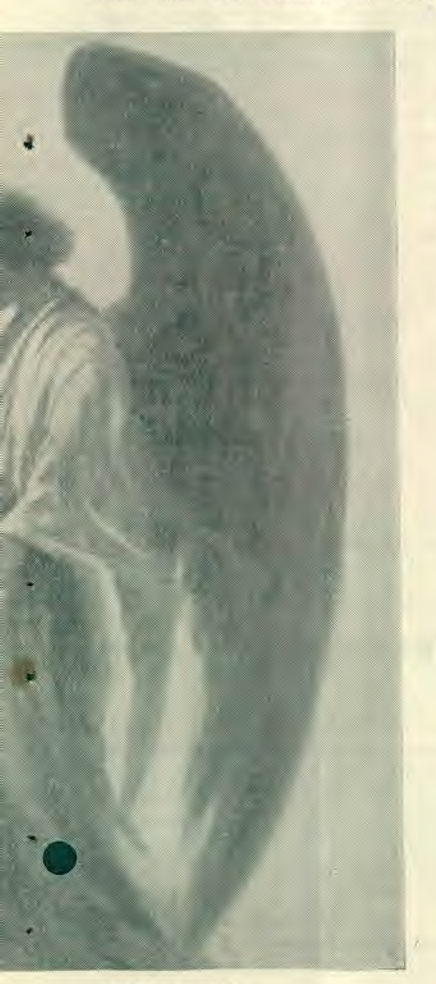
Jerusalem through the gates of pearl, to be for ever with his Lord. There he eats of the tree of life and drinks of the water of life. (1 Thess. 4:14-17; Rev. 21:24-27; 22:14, 17.)

At the second coming of Christ he is resurrected with all the saints of God and caught up to meet his Lord in the air, and with them he enters the New