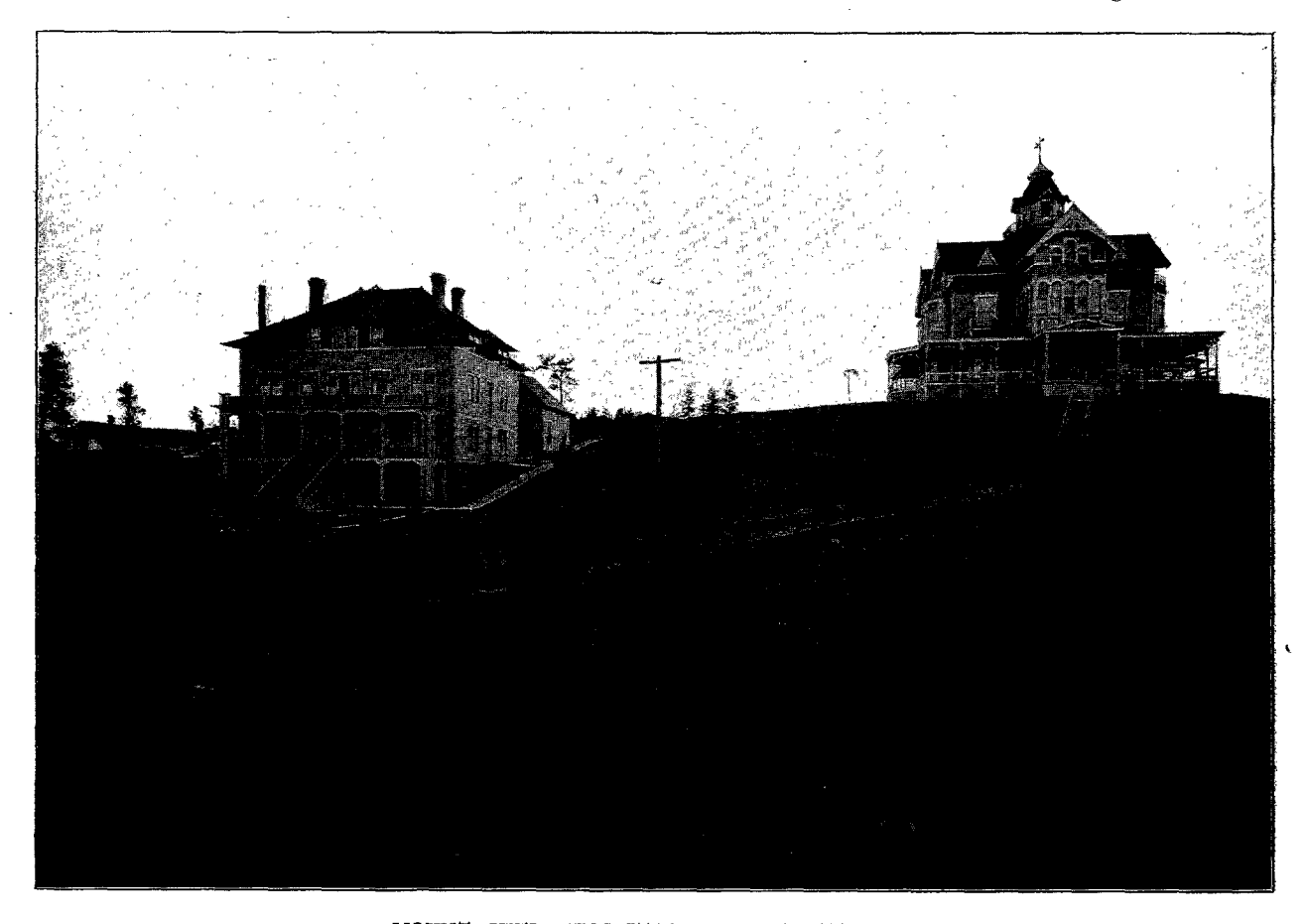
MOUNT VIEW HOSPITAL AND SANITARIUM

total has not been large. The A short account of the financial Upper Columbia Conference has creasing class in modern civili- history of the sanitarium might kindly paid the superintendent's not be without interest. Some salary until the work should get years before the opening of the well on its feet. Starting with work here, the "Helping Hand such a small capital, there has, an excellent experience in varied Mission" had been started in the of course, been indebtedness Since the erection of the hospital other city missions, and had found furnishing of the new buildexpect to follow up this line of from this advanced to the sanitar- that if the blessing of the Lord