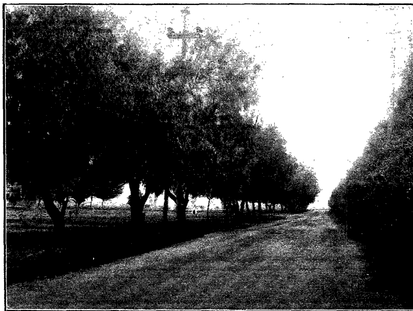
Pepper Drive in Front of the Academy

“Patriarchs and Prophets,” page 530, states the following: “To promote the assembling of the people for religious service, as well as to provide for the poor, a second tithe of all the increase was required. Concerning the first tithe, the Lord had declared, ‘I have given the children of Levi all the tenth in Israel.’ Num. 18:21. But in regard to the second He commanded, ‘Thou shalt eat before the Lord thy God, in the place which He shall choose to place His name there, the tithe of thy corn, of thy wine, and of thine oil, and the firstlings of thy herds and of thy flocks; that thou mayest learn to fear the Lord thy God always.’ This tithe, or its