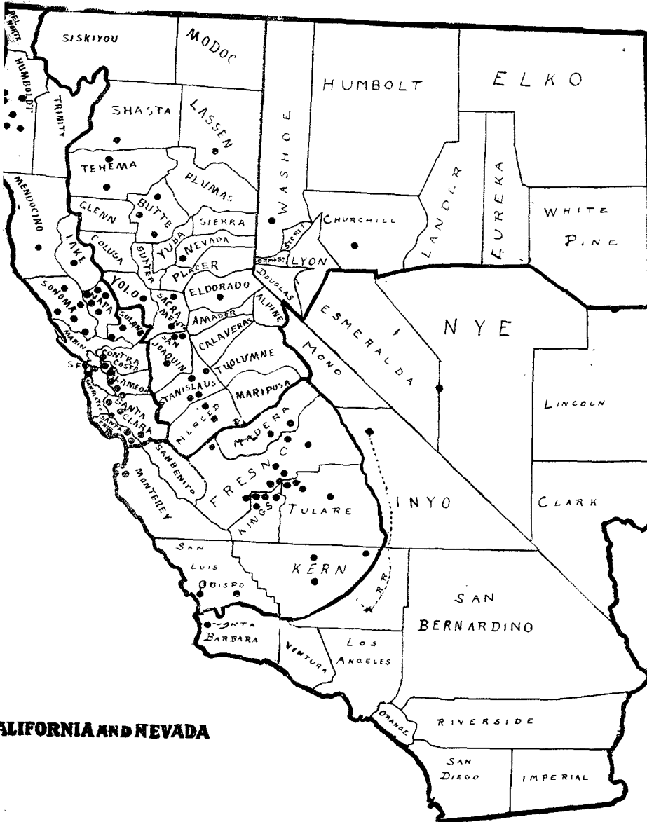
SHOWING PRESENT BOUNDARIES OF CONFERENCES

from home at such an early age. Assurance was given that it was not their intention to build up a large school with dormitory facilities for boarding students, but that such would be encouraged to attend at Lodi. It was freely expressed that the Lodi school should not be so restricted in its scope and territory that it could not be operated but at a financial loss; and to guard this feature the above was the understanding in the final settlement.