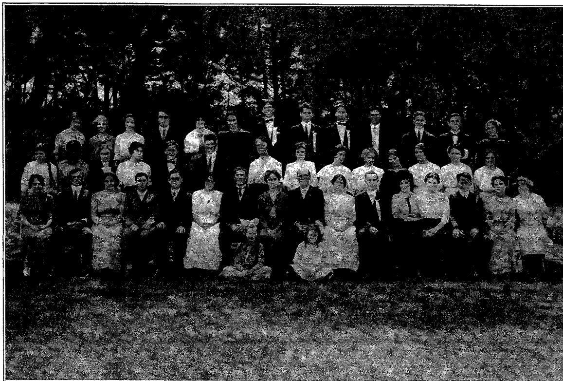
San Fernando Academy Students in Vocal and Instrumental Music, 1914

As the testing truths were presented, some began to think seriously of what