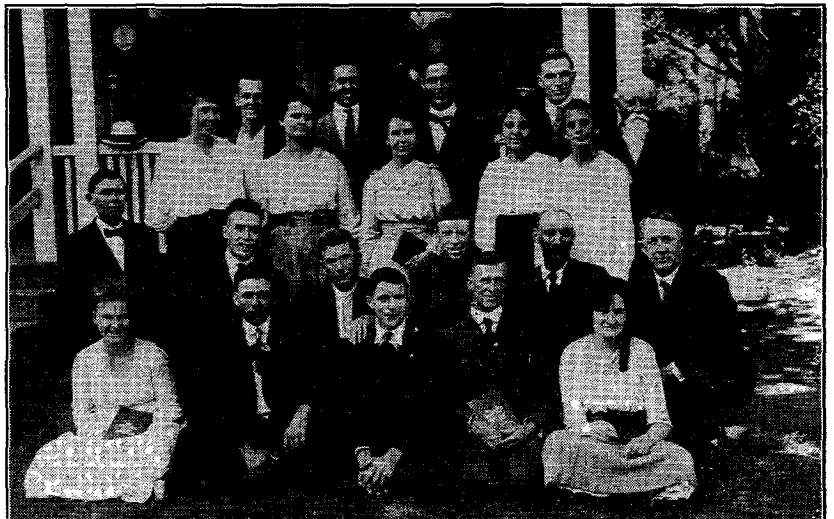
Colporteurs in Attendance at Institute, Fresno, Cal., June 12-19, 1919