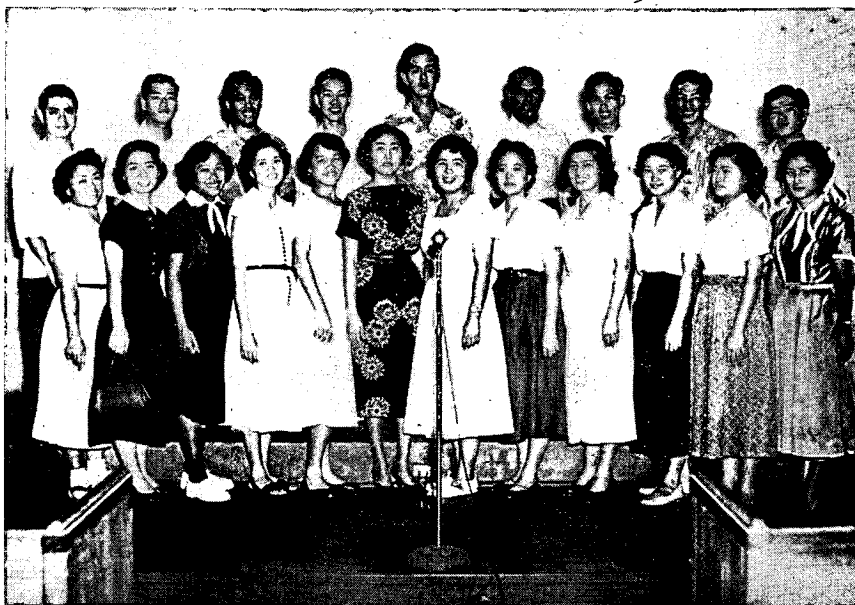
Pictured above is a part of the Aiea Choir who participated in the "Prince of Peace."

How many people have you enrolled in the Voice of Prophecy correspondence course? It is a very important form of missionary work and takes only a minimum amount of effort on your part.