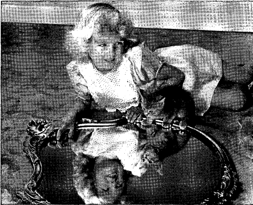
Children, like mirrors, reflect their environment.