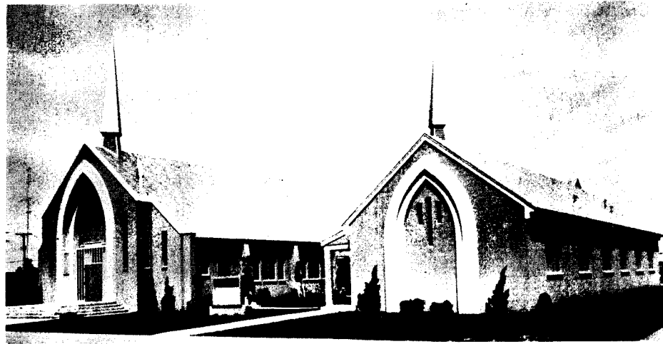
The Oxnard church which will be dedicated May 26 in afternoon services.