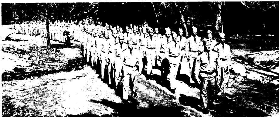
Cadets marching to church, carrying their Bibles with them. "With such an army of workers as our youth, rightly trained, might furnish, how soon the message of a crucified, risen, and soon-coming Saviour might be carried to the whole world!"