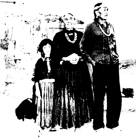
A typical Navajo family and hogan.

A friendly discussion and some questions follow. The visitors, one by one, arise from their seats. The host gets up and hands out the coats. There are warm smiles and goodbyes all around and the visitors leave.