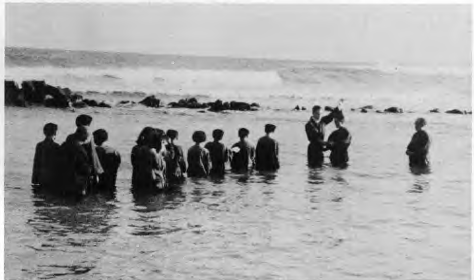
The Friday evening baptismal scene, Poipu Beach, Kauai.