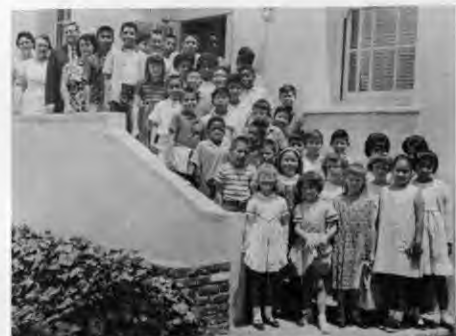
A portion of the students enrolled in the White Memorial Union School Summer Session.