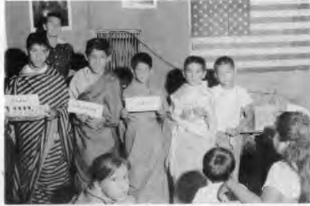
Five of the boys portray some of the Bible characters they had been studying for the previous two weeks.

The Guadalupe Vacation Bible School was operated under difficulties, but with the Lord's blessings. Seventy youngsters were enrolled and all from non-Adventist homes. The walls of the one-room shack were water stained and the roof was sagging, but the children didn't mind. Their homes were like this too. The fact that all classes met in the same room at the same time didn't bother the children either. They thought it was supposed to be this