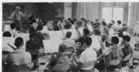
Rehearsal time for the band.

Each day started with joint worship followed by instructional and practice periods for orchestra, band, general chorus, choir, madrigal singers, art classes, counterpoint instruction, etc. From 1 until 4 each afternoon, time was allotted for recreational activities such as swimming, golfing, water skiing, and softball. Evenings included concerts by guest performers, with the last two nights featuring mass concert recitals by the many vocal and other musical groups. Everyone participated in one way or another.