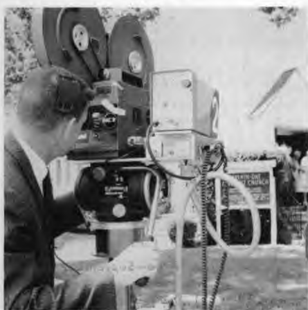
The Number 2 camera of Snazelle Productions makes the closing moments of the recent Adventist Hour telecast from the Mountain View church. The unique system for filming and recording the service employs the use of two cameras and two video cameras.

ARTHUR J. ESCOBAR, Radio-Television Dept.