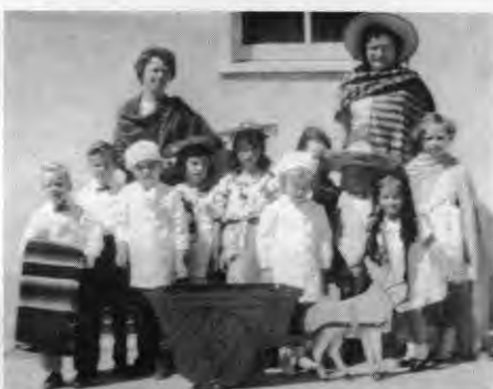
The Martinez Kindergarten Department gave the Thirteenth Sabbath Offering appeal to the Senior Division on June 29.