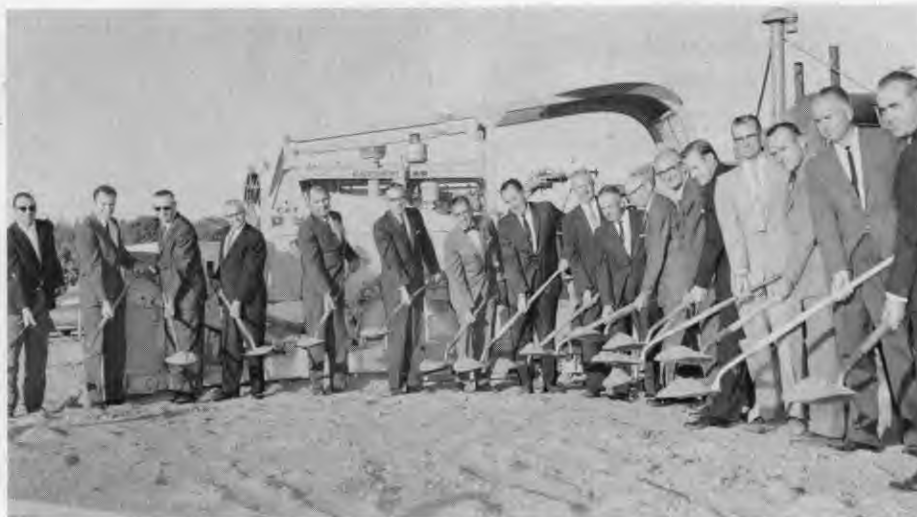
Ground breaking for the Paradise church.

✓ The Redding church is sponsoring the daily broadcast of The Voice of Prophecy over station KQMS Monday through Friday at 9:30 a.m.; on Sabbath the time is 7:30 a.m.