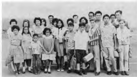
The Aiea Pathfinders as they arrived at the Kona Airport.