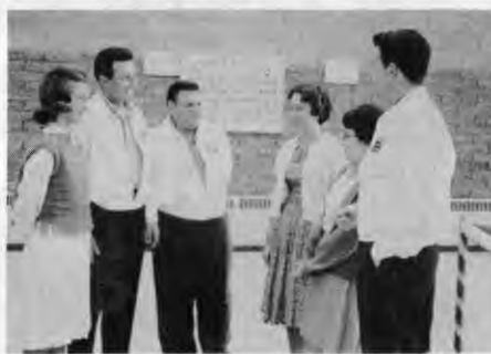
Featured at the music camp were the King's Heralds. Three of the radio quartet found a moment to visit with some of the campers.