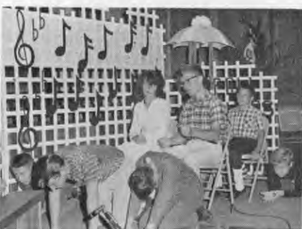
Camelback Pathfinder skit at the talent program. This skit was called "A Sunday Afternoon Ride."