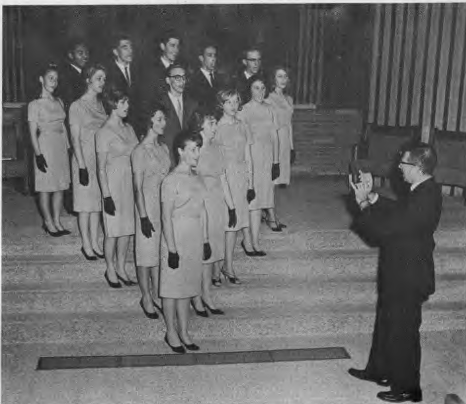
This group from the Hawthorne, California, church won twenty-five individuals through their Voice of Youth meetings.