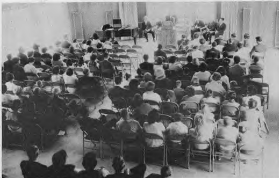
Literature evangelists and their families enjoy church services at Pine Springs Ranch.