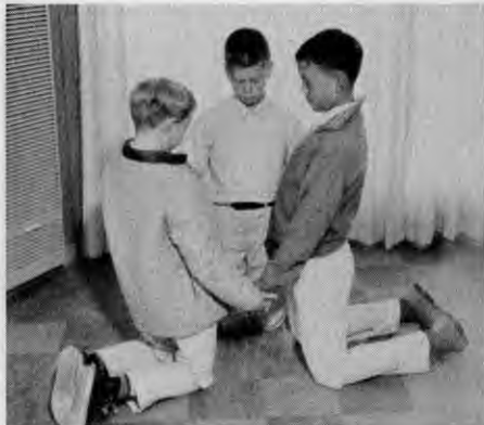
Three future colporteurs learning the value of prayer early in the morning, to have things go right throughout the day.