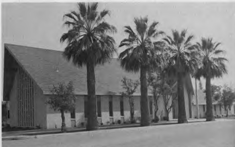
The Bakersfield, California, Spanish church.